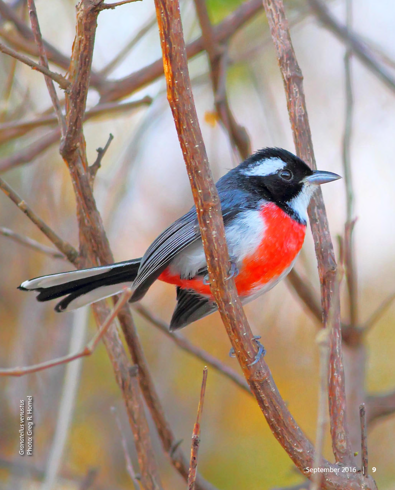
Granatellus venustus