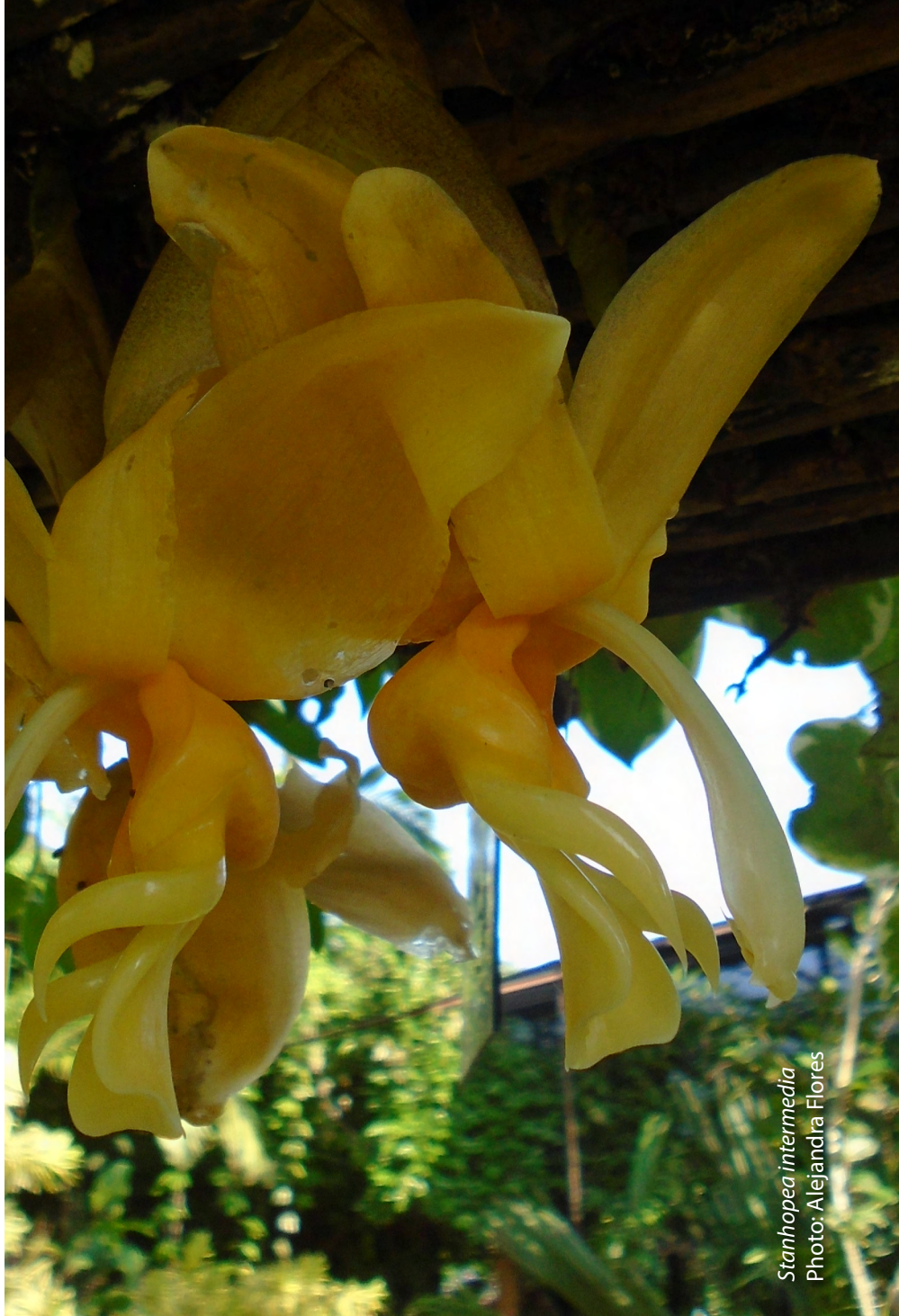
Stanhopea intermedia

Several of these exquisite orchids are now in bloom at the Vallarta Botanical Garden, but each individual blossom is an ephemeral moment of usually only twenty-four hours or so. Predicting the exact moment of its bloom is tough, so just make a visit when you can, and with any luck you will arrive to see a botanical marvel!