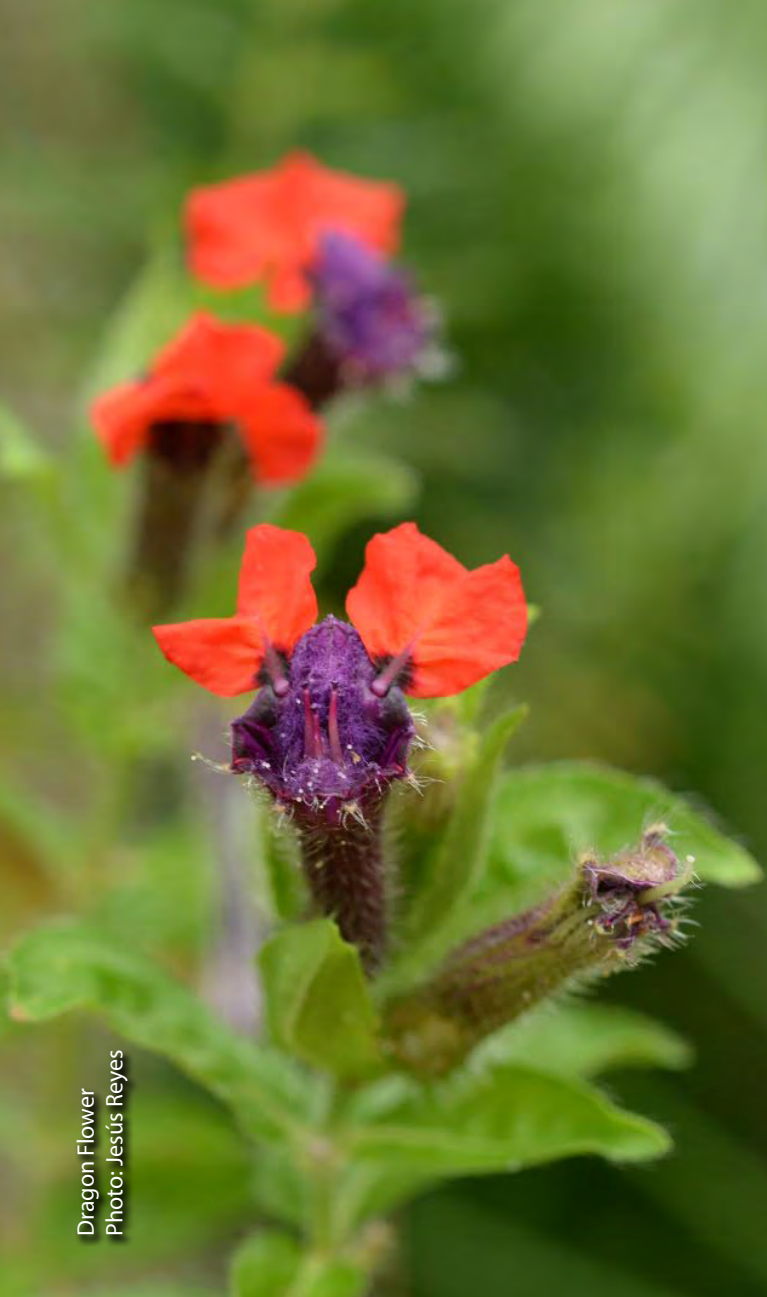
Dragon Flower