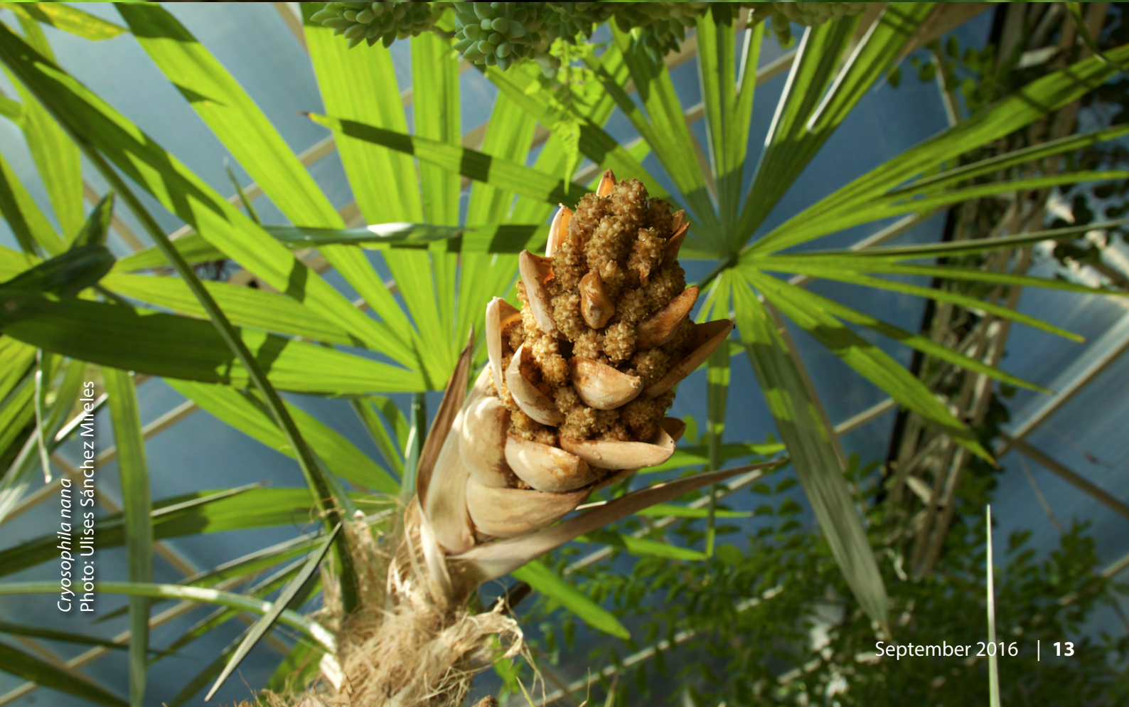
Cryosophila nana