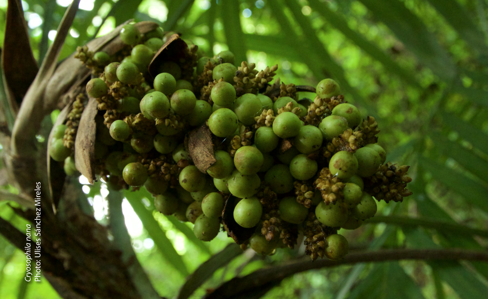
Cryosophila nana