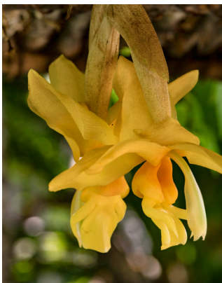
Cover: Stanhopea intermedia Mansur Kiadeh