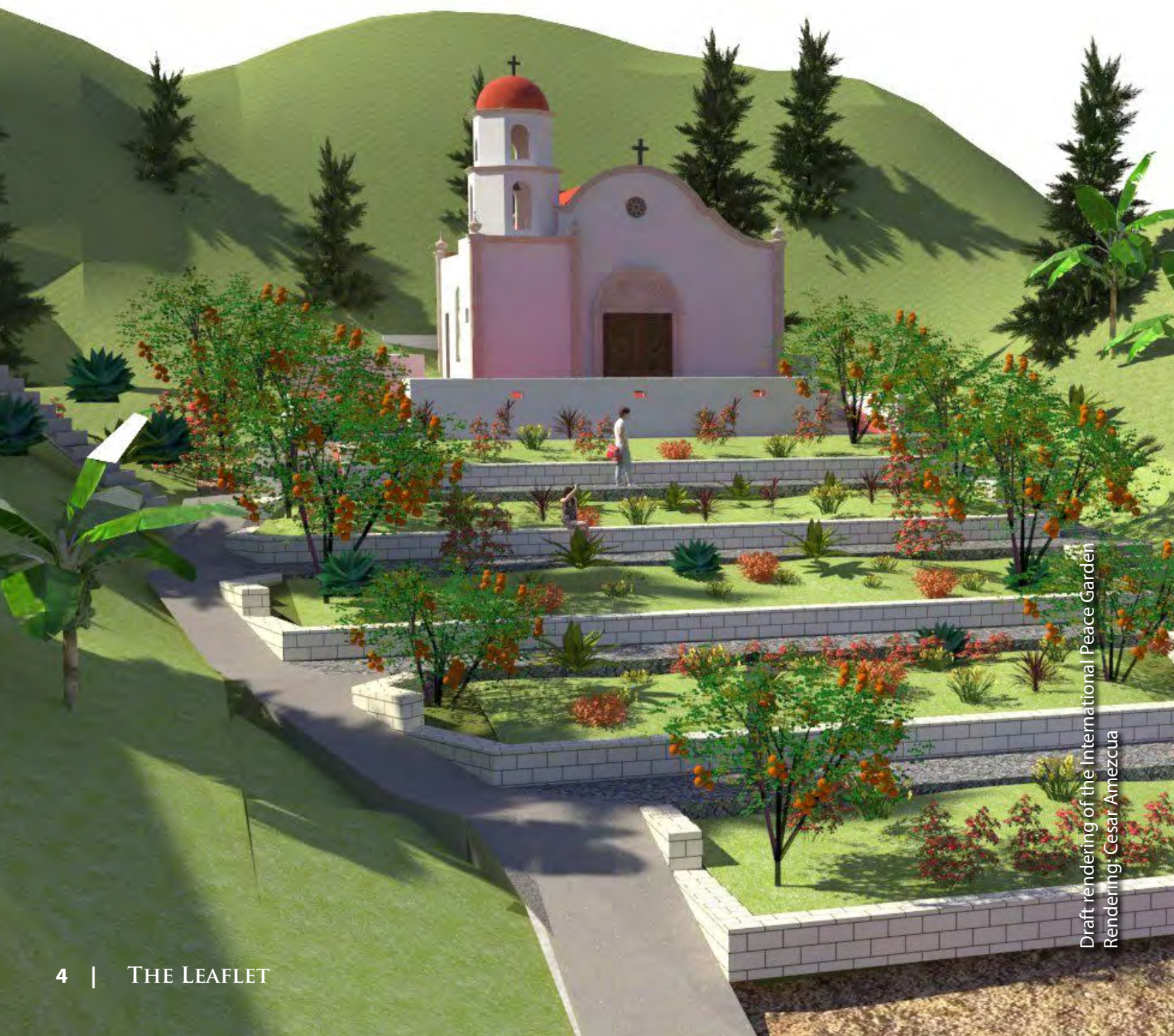
Draft rendering of the International Peace Garden Rendering: Cesar Amezcua

The International Peace Garden Foundation, in participation with the mayors of Puerto Vallarta and Cabo Corrientes, just announced the designation of this project as Mexico's official International Peace Garden and a ceremony is scheduled to bestow this special status on February 16, 2017. While this designation is certain to bring great notoriety to the garden and the Puerto Vallarta region as a welcoming destination dedicated to international peace and friendship, it brings no direct funding. The Vallarta Botanical Garden a goal to raise $1,100,000 MXN for this project by November 1st, 2016.