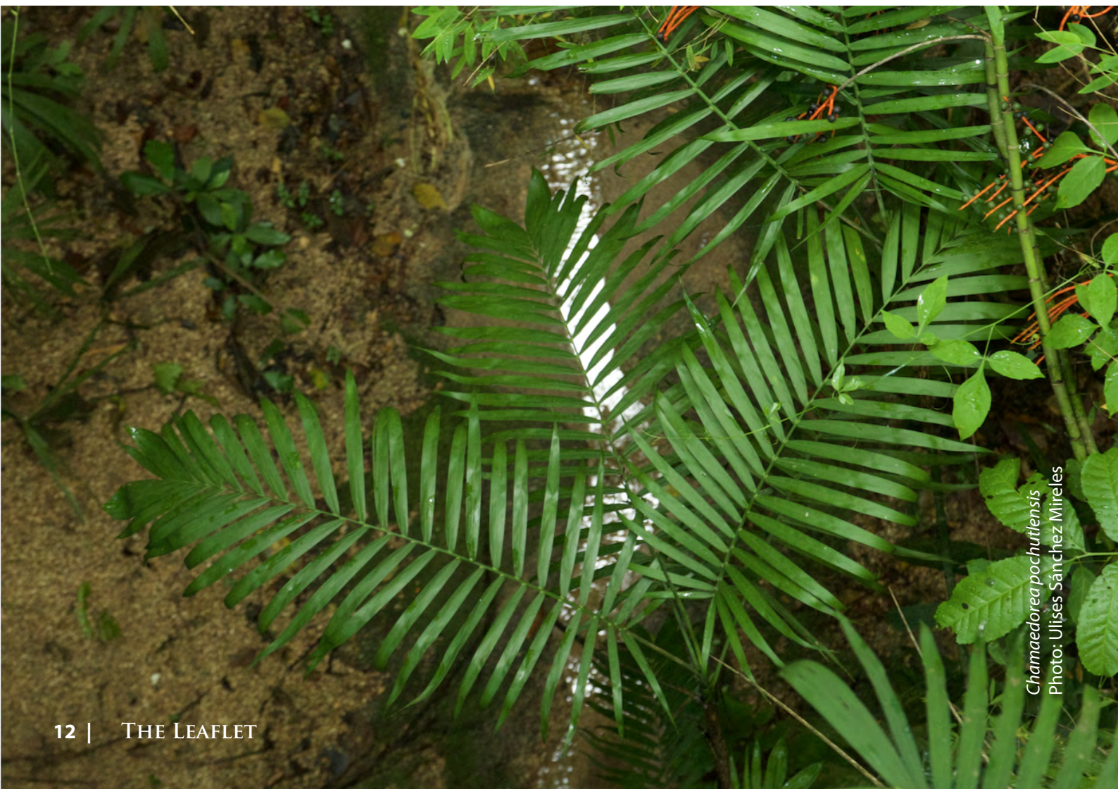
Chamaedorea pochutlensis

Knowing the various uses of our natural resources is an important first step to protecting them. If we use them properly, we can both enrich our culture and care for our environment.