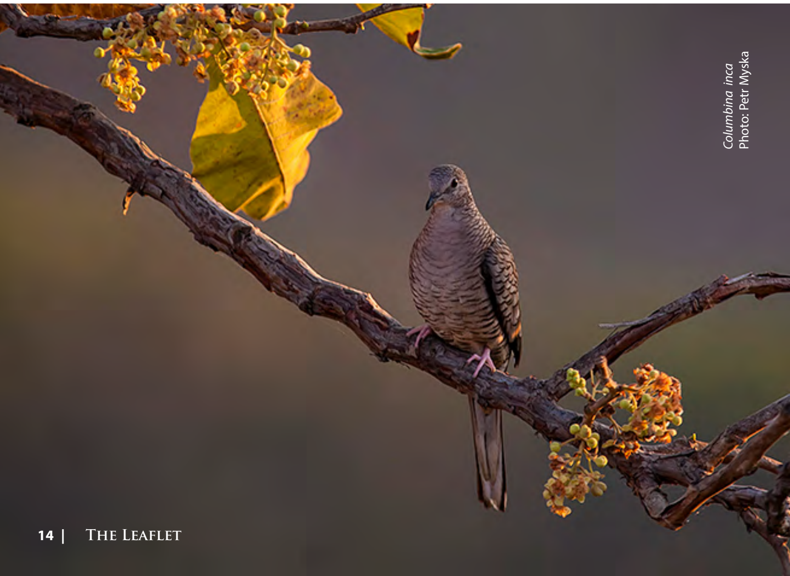
Columbiga inca

Please visit... and prepare to be inspired!