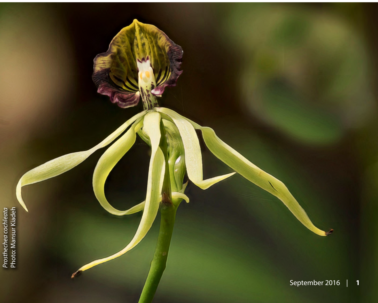
Prosthechea cochleata