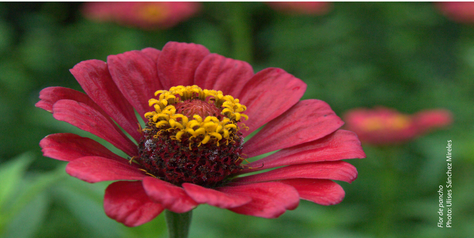
Flor de pancho

* Some activities subject to change. The most current calendar, often with links to further event information, can be viewed at www.vbgardens.org/calendar .