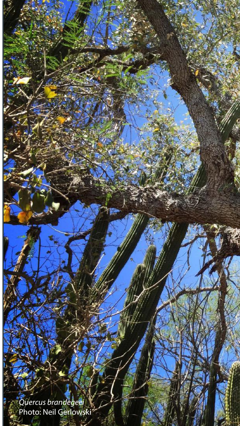
Quercus brandegeei