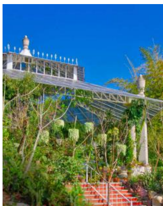
Cover Photo: Vallarta Conservatory of Orchids and Native Plants