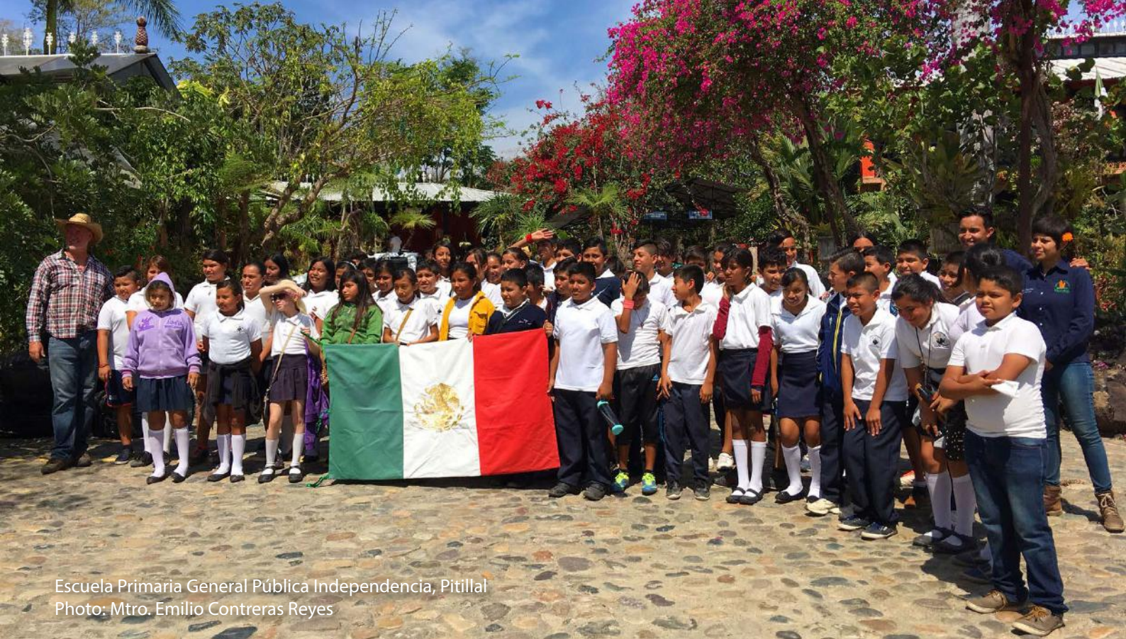
Escuela Primaria General Pública Independencia, Pitillal