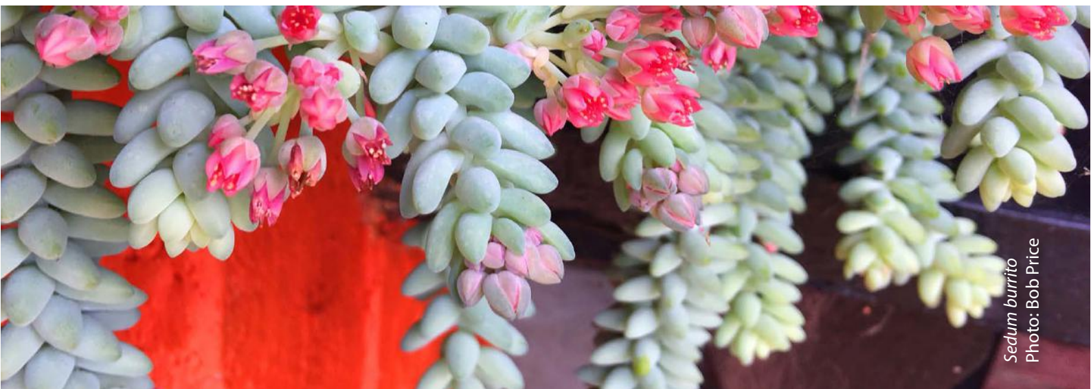
Sedum burrito

* Some activities subject to change. The most current calendar, often with links to further event information, can be viewed at www.vbgardens.org/calendar .