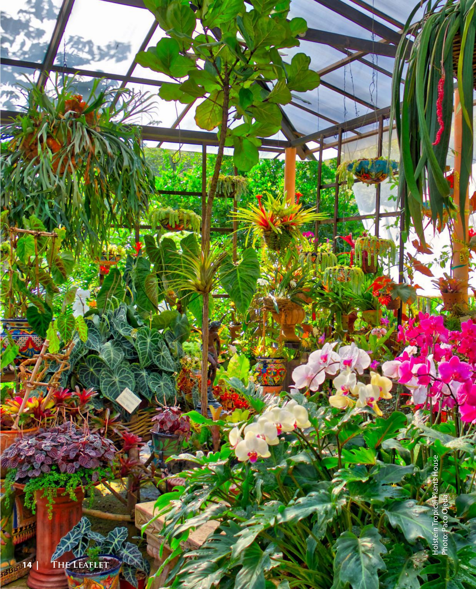
Holstein Tropical Plants House