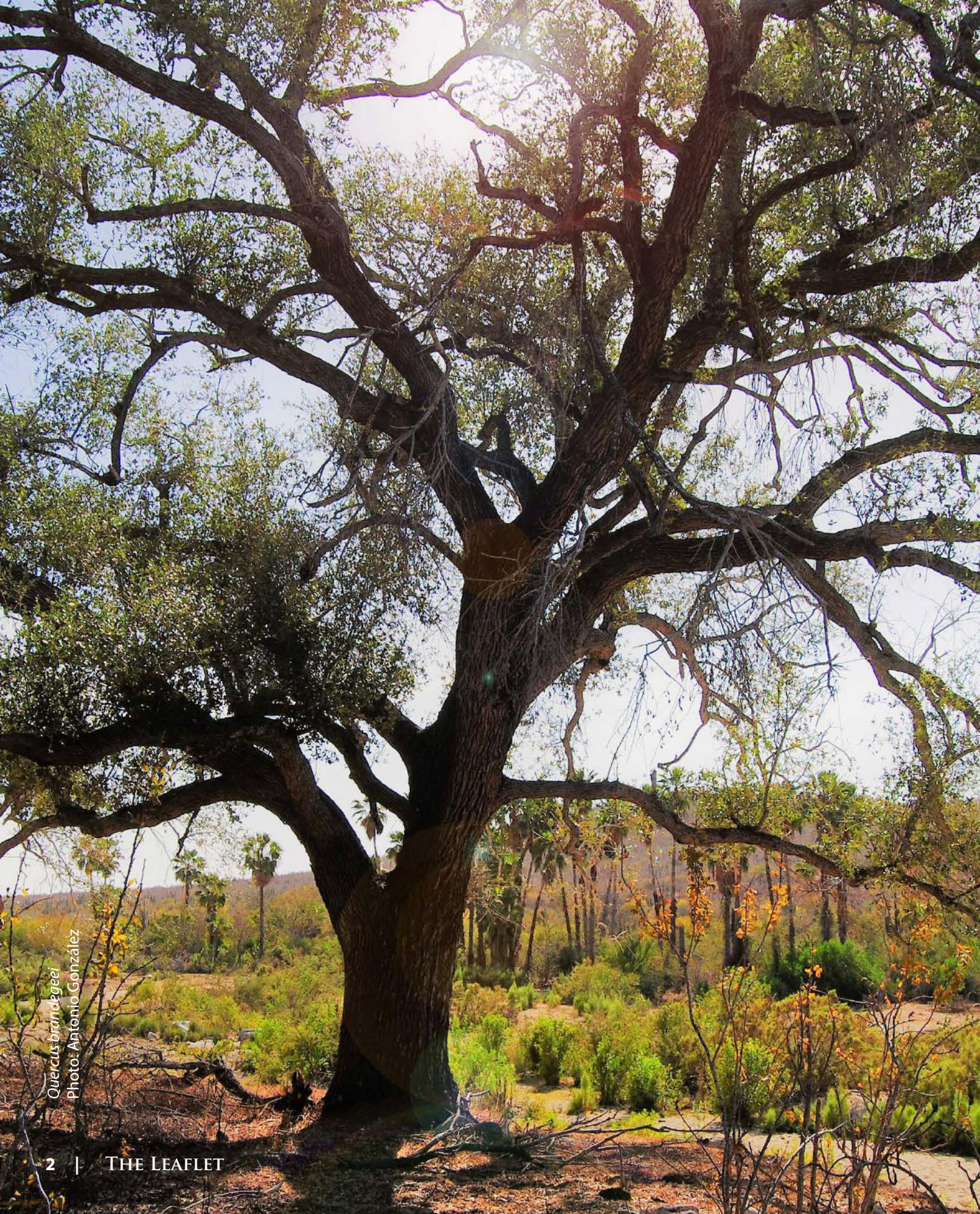
Quercus branmdegeei