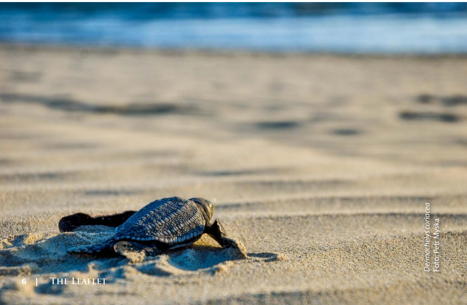
Dermochelys coriacea

While threats such as beach “development” and the “bycatch” of enormous fishing vessels are beyond the ability of most individuals to take on themselves, there are a few important things that each of us can do to help protect sea turtles. High on the list is for us to properly