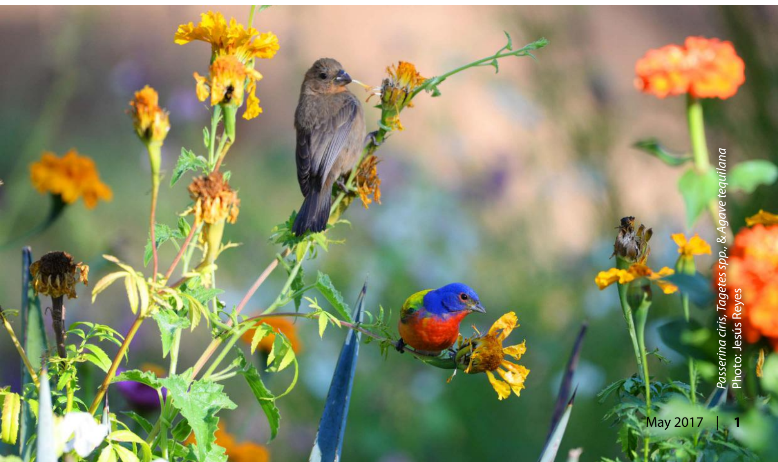
Passerina ciris, Tagetes spp., & Agave tequilana