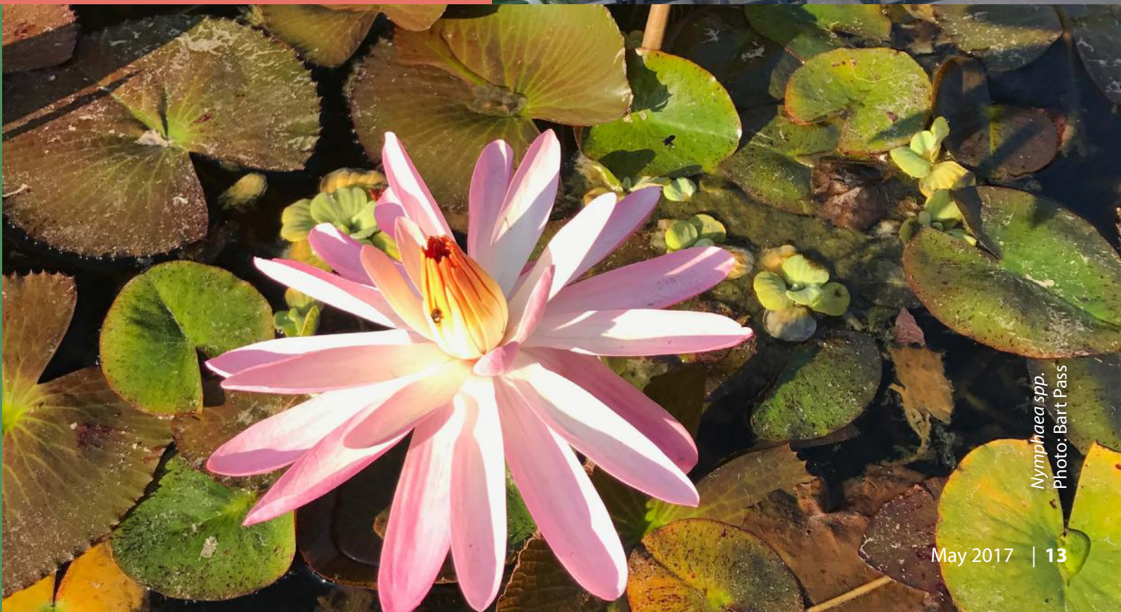
Nymphaea spp.