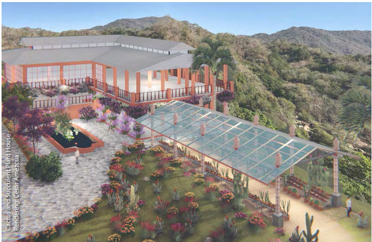
Cactus and Succulent Plant House