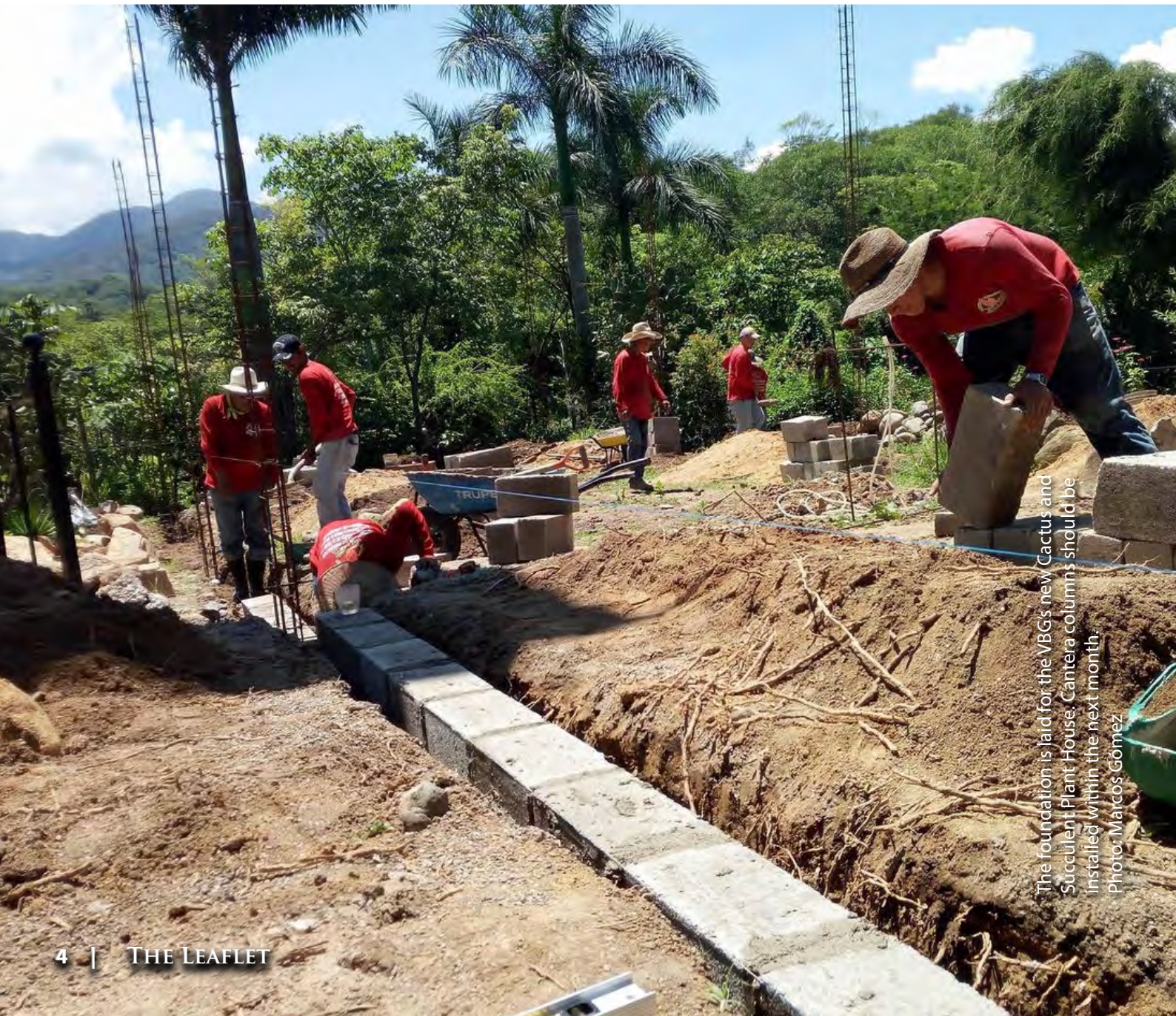
The foundation is laid for the VBG's new Cactus and Succulent Plant House. Cantera columns should be installed within the next month.

We invite you to join us as one of the first visionary contributors toward the Cactus and Succulent Plant Project. Your tax-deductible gift will create a legacy of cactus and succulent plant cultivation and display at the Vallarta Botanical Garden. Together we will also create a powerful new attraction for our visitors.