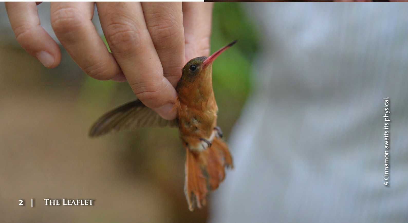
A Cinnamon awaits its physical.