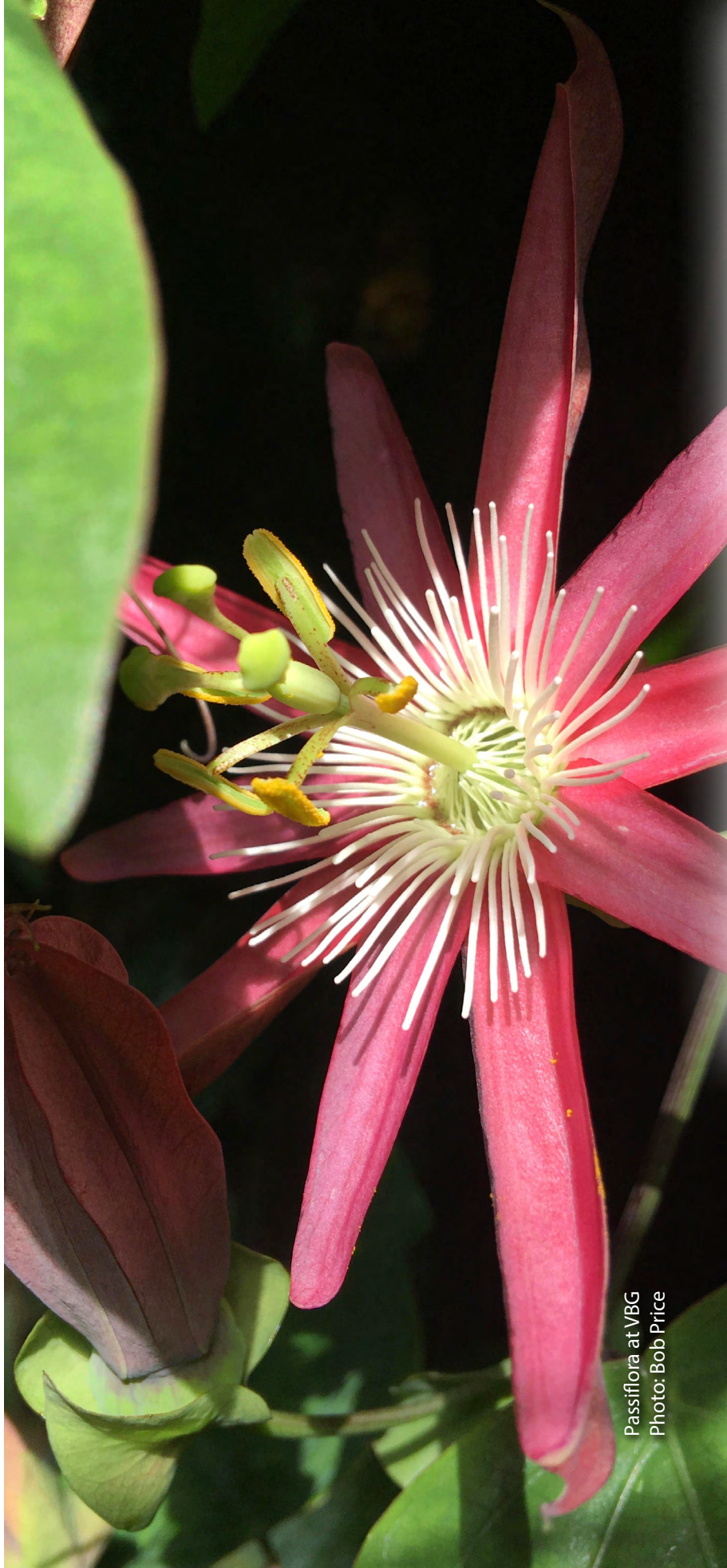
Passiflora at VBG

Including the Vallarta Botanical Garden in your wills, trusts, and estate planning is an investment in the long-term viability of this important natural sanctuary for Puerto Vallarta and the exquisite flora of Mexico and world tropics. A member of the Garden’s Legacy Committee would be happy to talk to you about the best options for optimizing your philanthropic potential and further blessing a community. Please write to info@vbgardens.org .