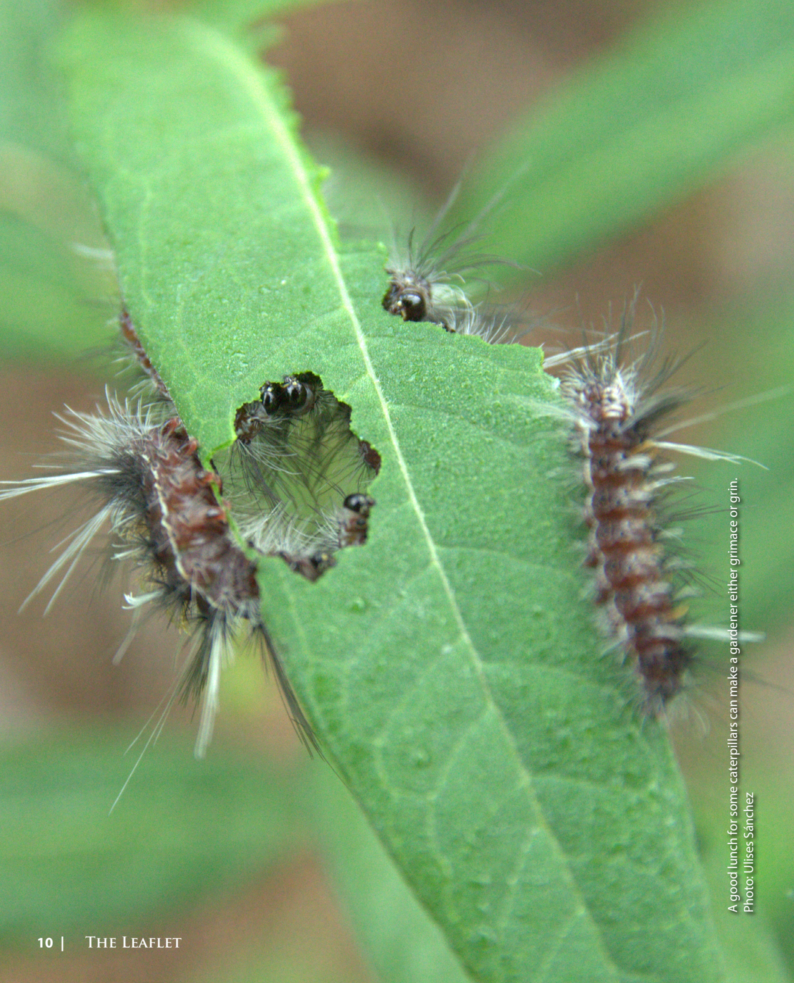
A good lunch for some caterpillars can make a gardener either grimace or grin.