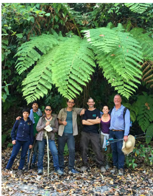
Cover: Exploring botanical treasures in the mountains beyond Mismaloya.