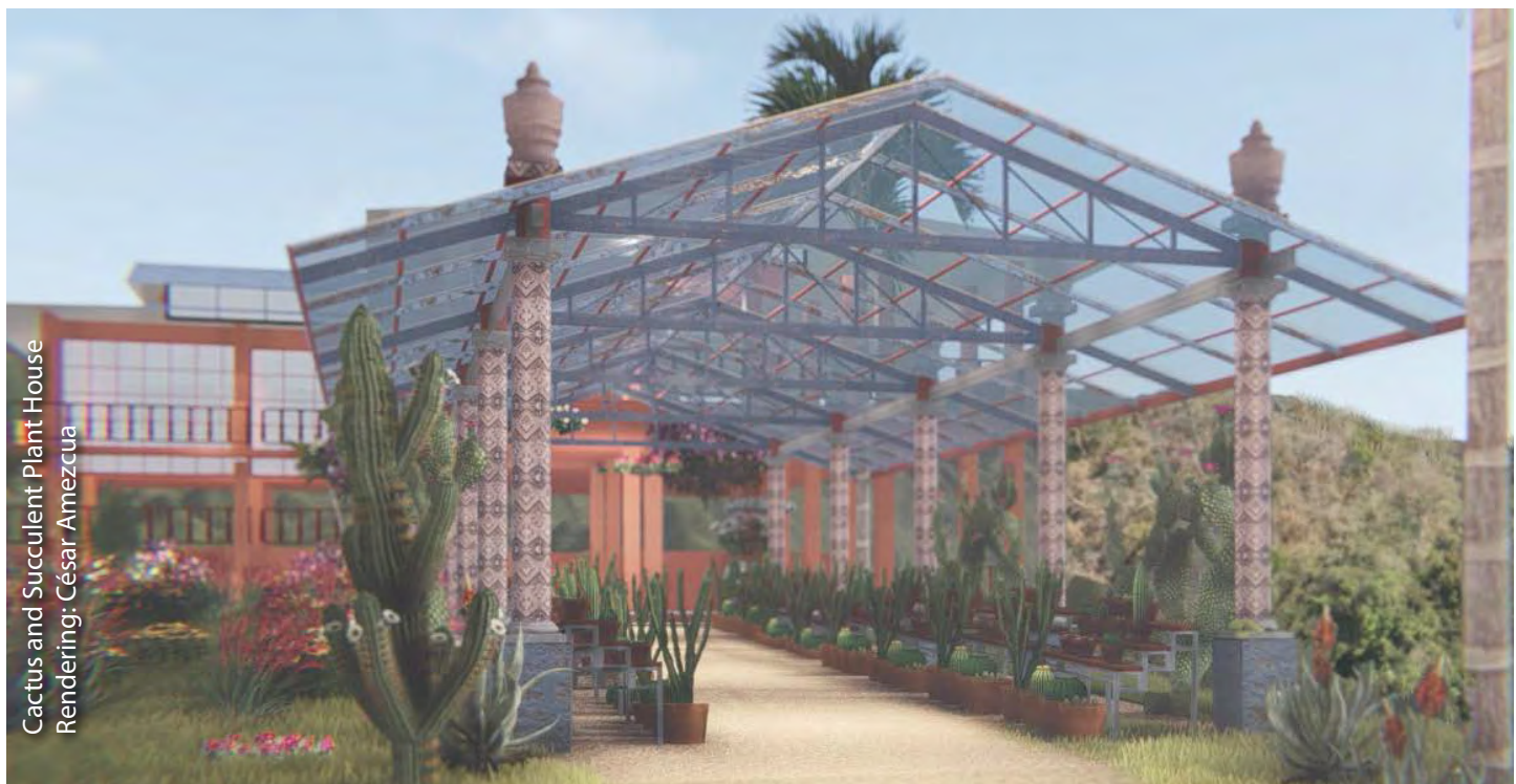
Cactus and Succulent Plant House