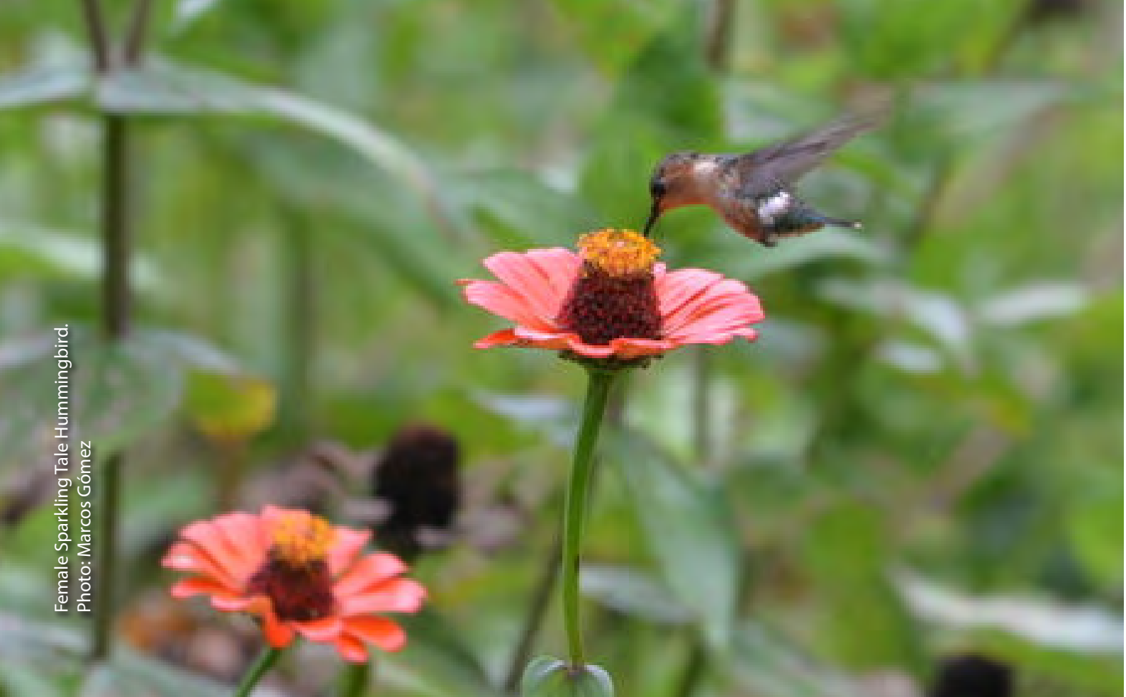
Female Sparkling Tale Hummingbird.