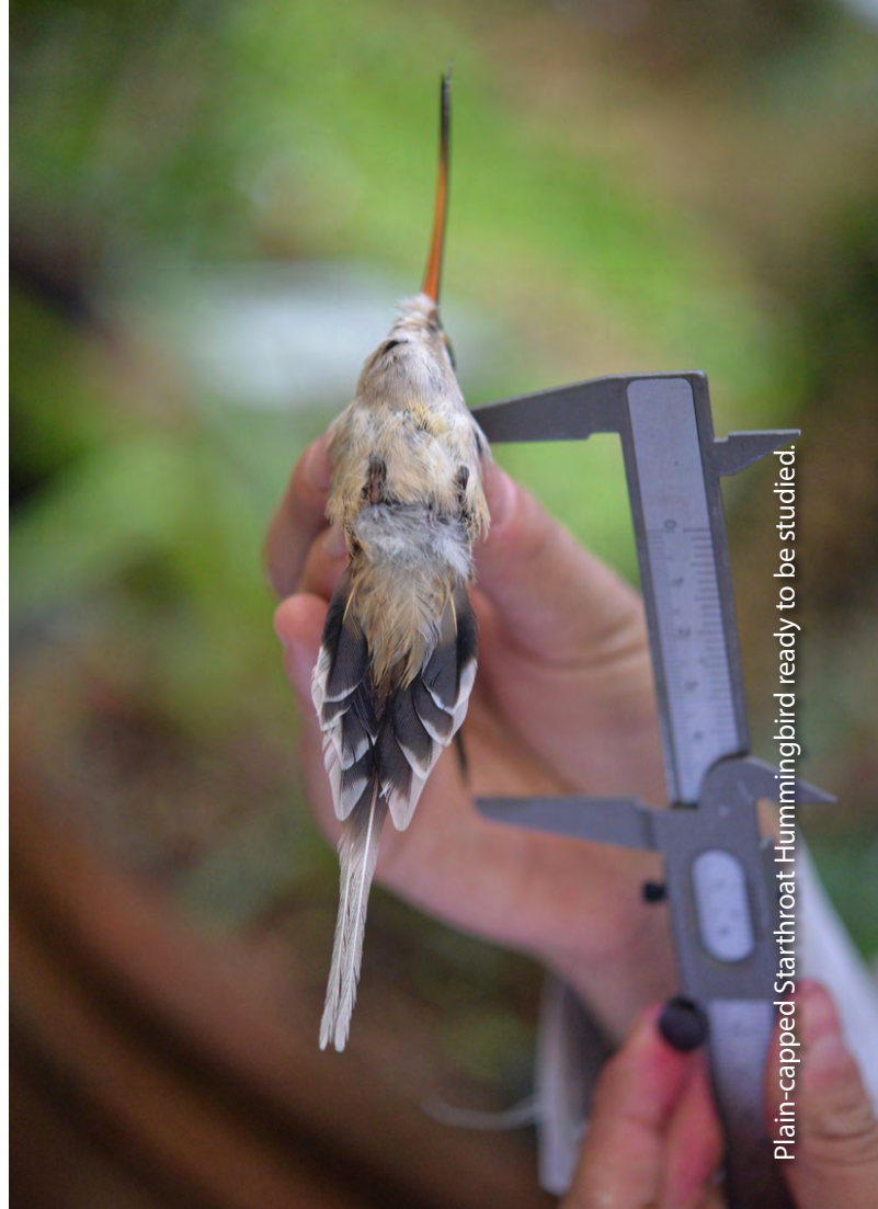
Plain-capped Starthroat Hummingbird ready to be studied.

This type of collaboration with researchers and the UNAM helps support new knowledge of Mexican biodiversity and environmental education.