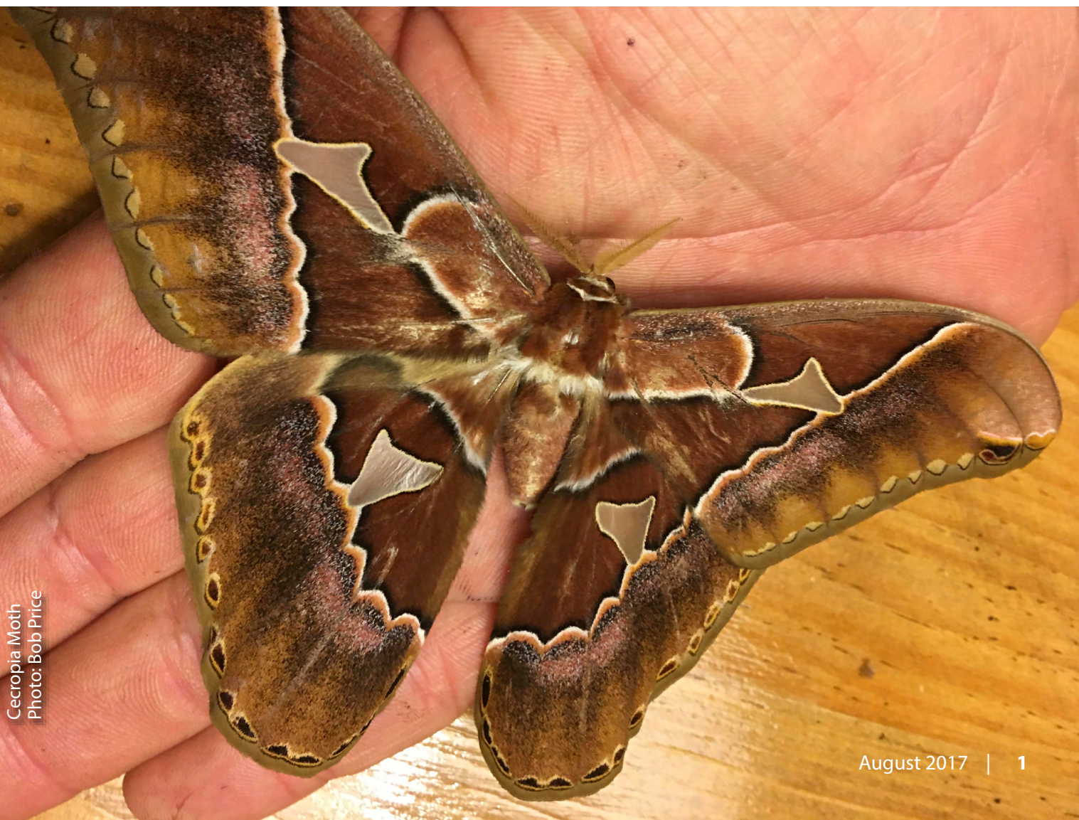
Cecropia Moth