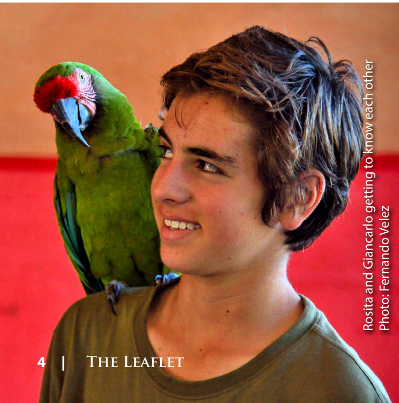
Rosita and Giancarlo getting to know each other