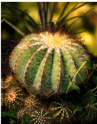
Cover: Parodia magnifica