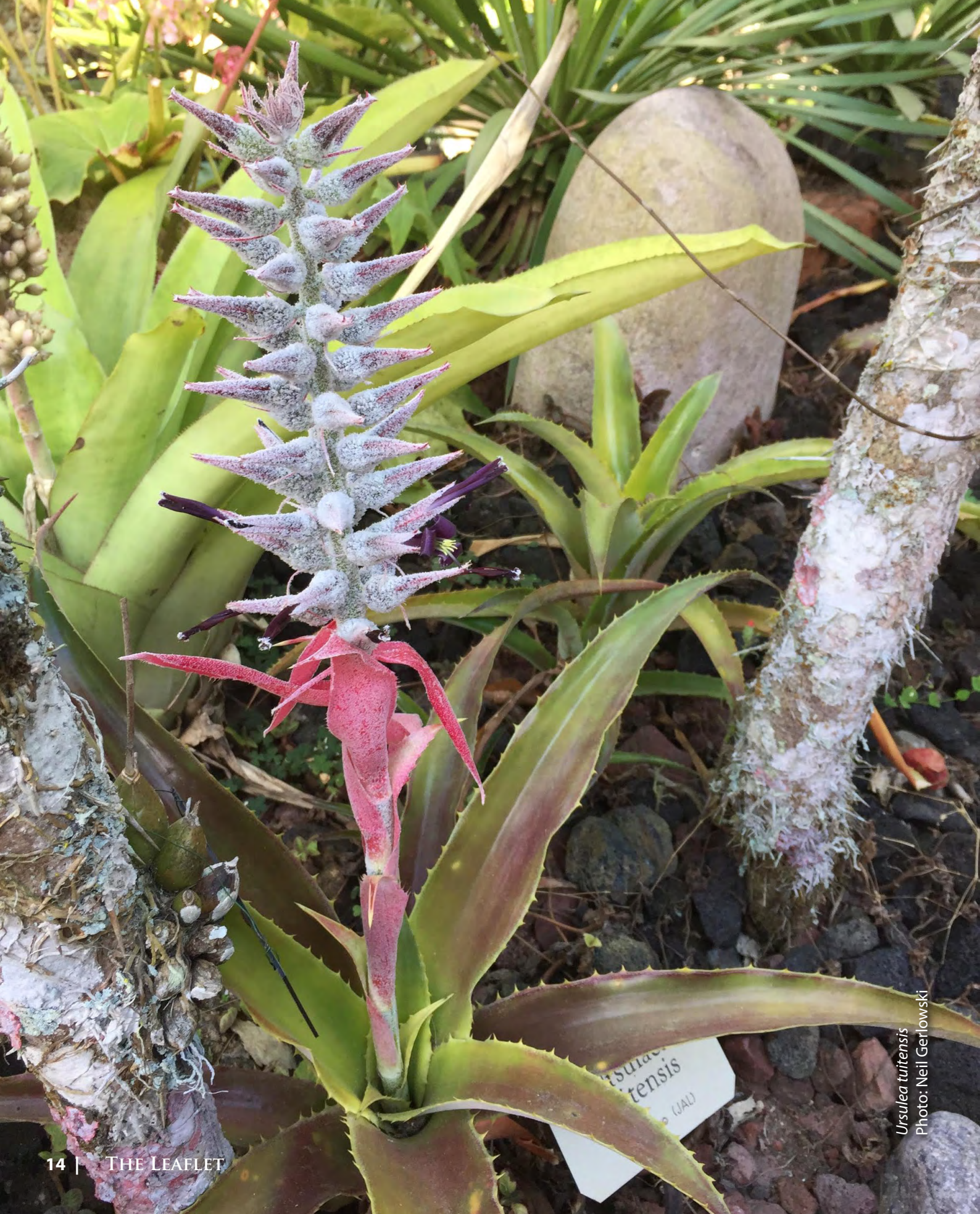
Ursulea tuitensis