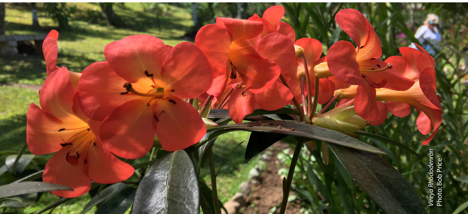
Vireya Rhododendron

* Some activities subject to change. The most current calendar, often with links to further event information, can be viewed at www.vbgardens.org/calendar .