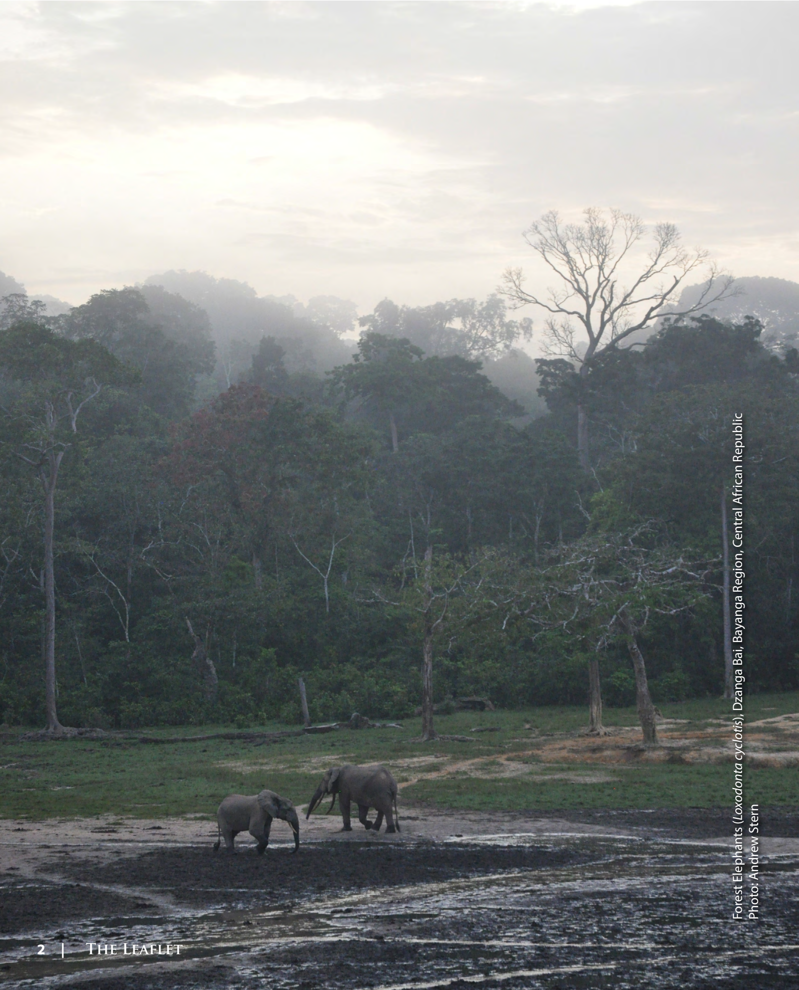
Forest Elephants ( Loxodonta cyclotis ), Dzanga Bai, Bayanga Region, Central African Republic