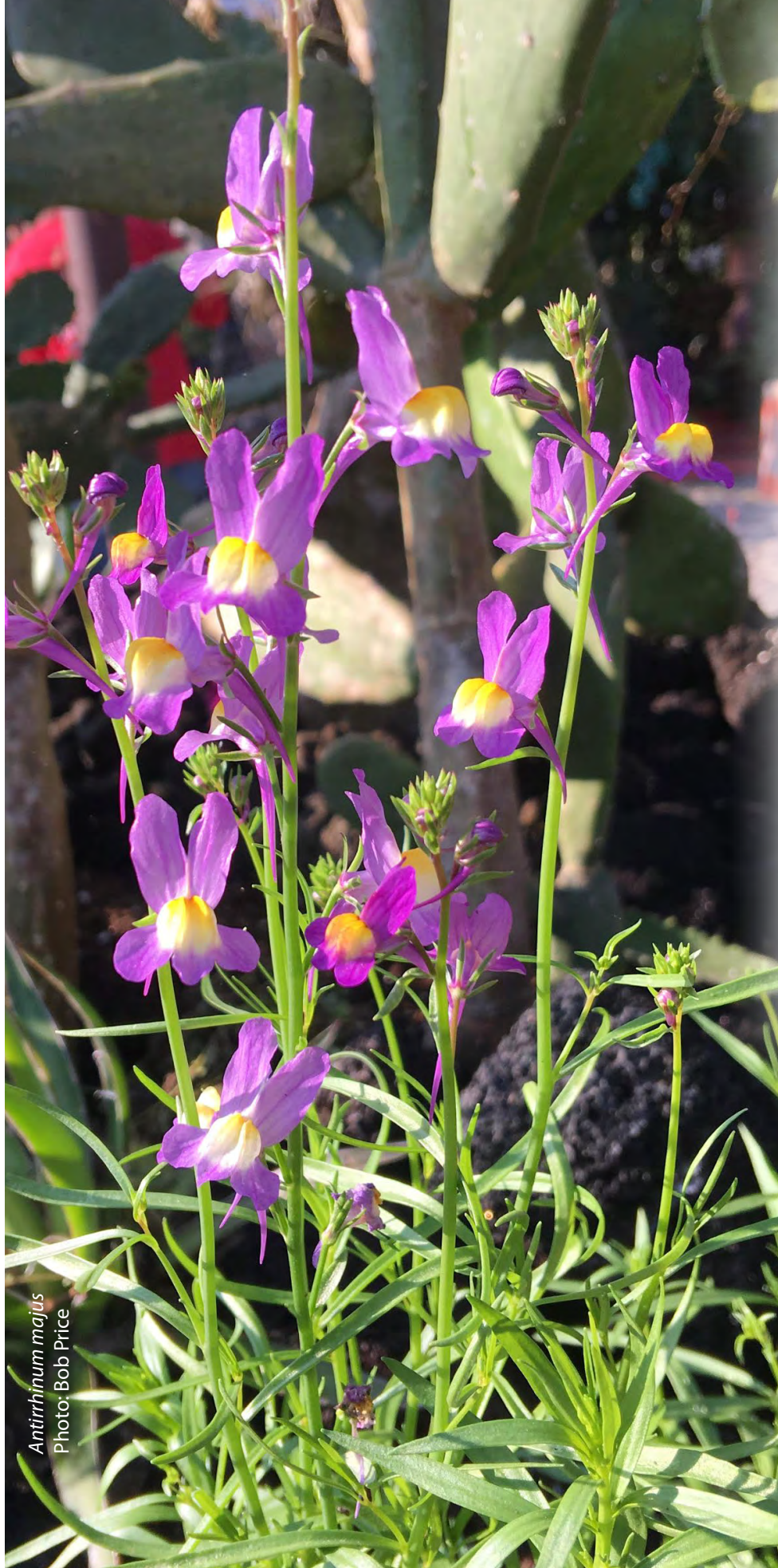
Antirrhinum majus

Including the Vallarta Botanical Garden in your wills, trusts, and estate planning is an investment in the long-term viability of this important natural sanctuary for Puerto Vallarta and the exquisite flora of Mexico and world tropics. A member of the Garden’s Legacy Committee would be happy to talk to you about the best options for optimizing your philanthropic potential and further blessing a community. Please write to info@vbgardens.org .