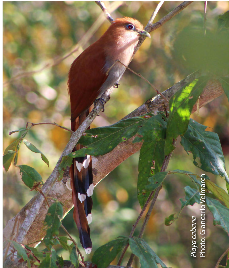
Playa cabana