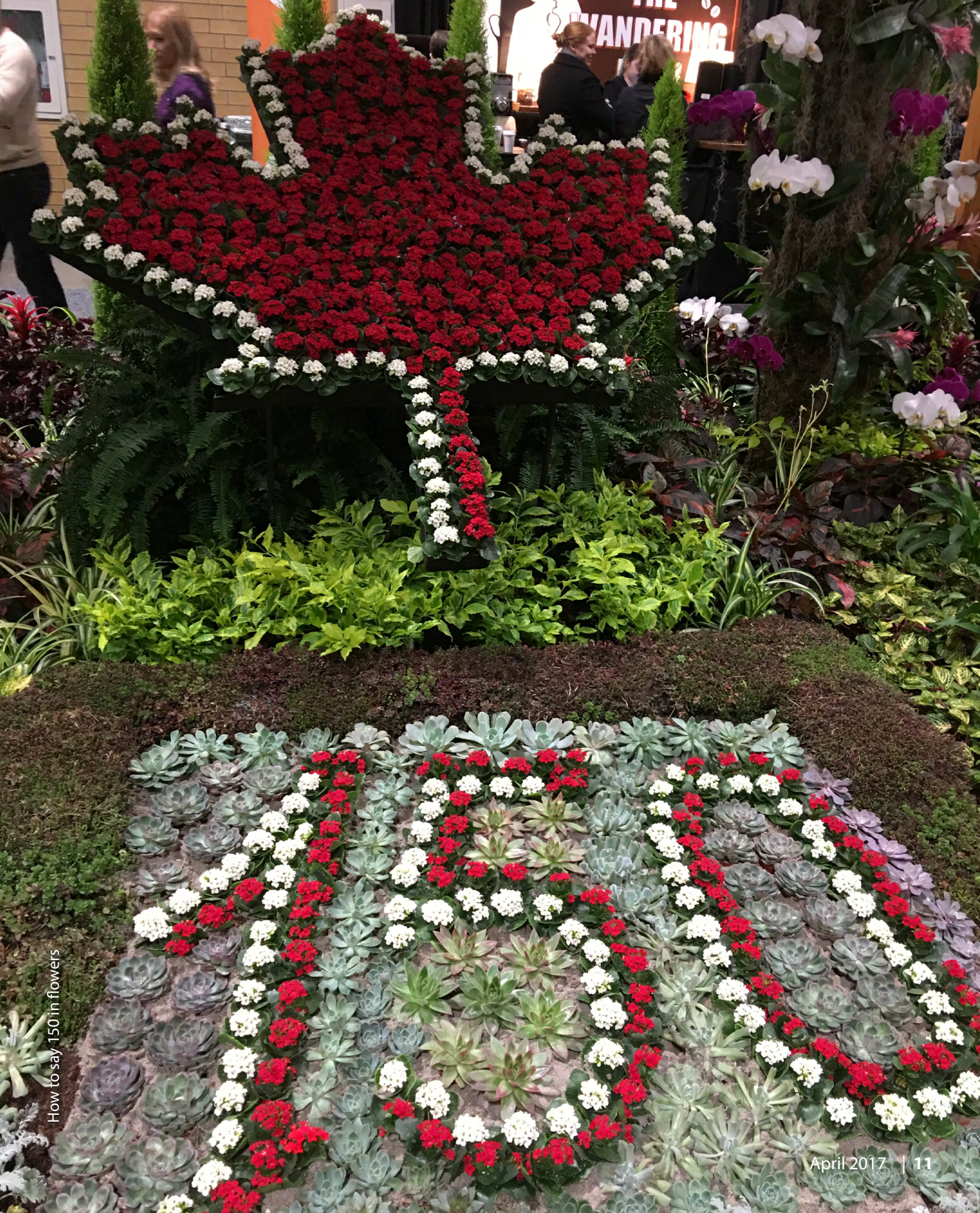
How to say 150 in flowers