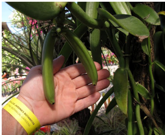
Vanilla "Beans" at the Vallarta Botanical Gardens

Culinary vanilla ( Vanilla planifolia ) was first cultivated by the Totonac people of the Gulf Coast of Mexico in the present-day state of Veracruz. According to their mythology, the tropical vanilla orchid was born from a story of love and tragedy. When Princess Xanat, forbidden by her father from marrying a mortal, fled to the forest with her lover, the two were captured and beheaded. Where the blood of the princess' lover touched the ground a tree grew and next to it, where the princess' blood touched the ground the vine of the vanilla orchid grew attaching to the tree forever. Mexico had a near monopoly on vanilla production until 1841 when a 12-year-old slave child living on the French island of Bourbon (now called Réunion) discovered a simple way to hand-pollinate the flower. Because of the labor required to pollinate and cure vanilla, it is the second most expensive spice (after saffron). Learn more about this incredible plant first hand with your next visit to the Vallarta Botanical Garden.