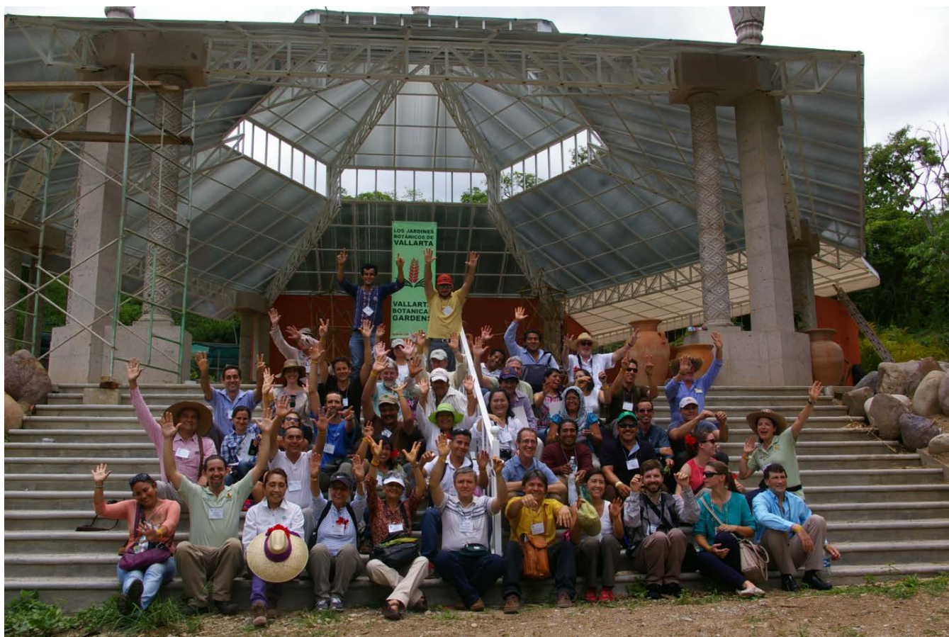
Group photo of participants in the first The Sentinel Plant Network's first Workshop of the Americas hosted by the Vallarta Botanical Garden.

Caption with names of participants can be opened here .