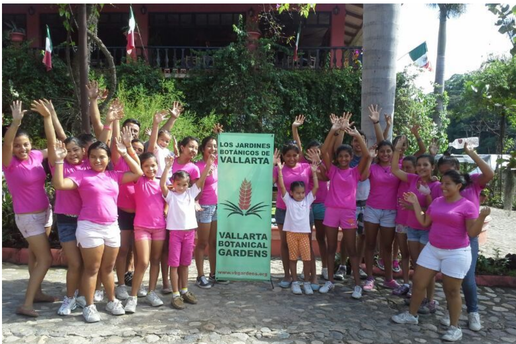
Visiting children from the Casa Hogar Corazón de Niña