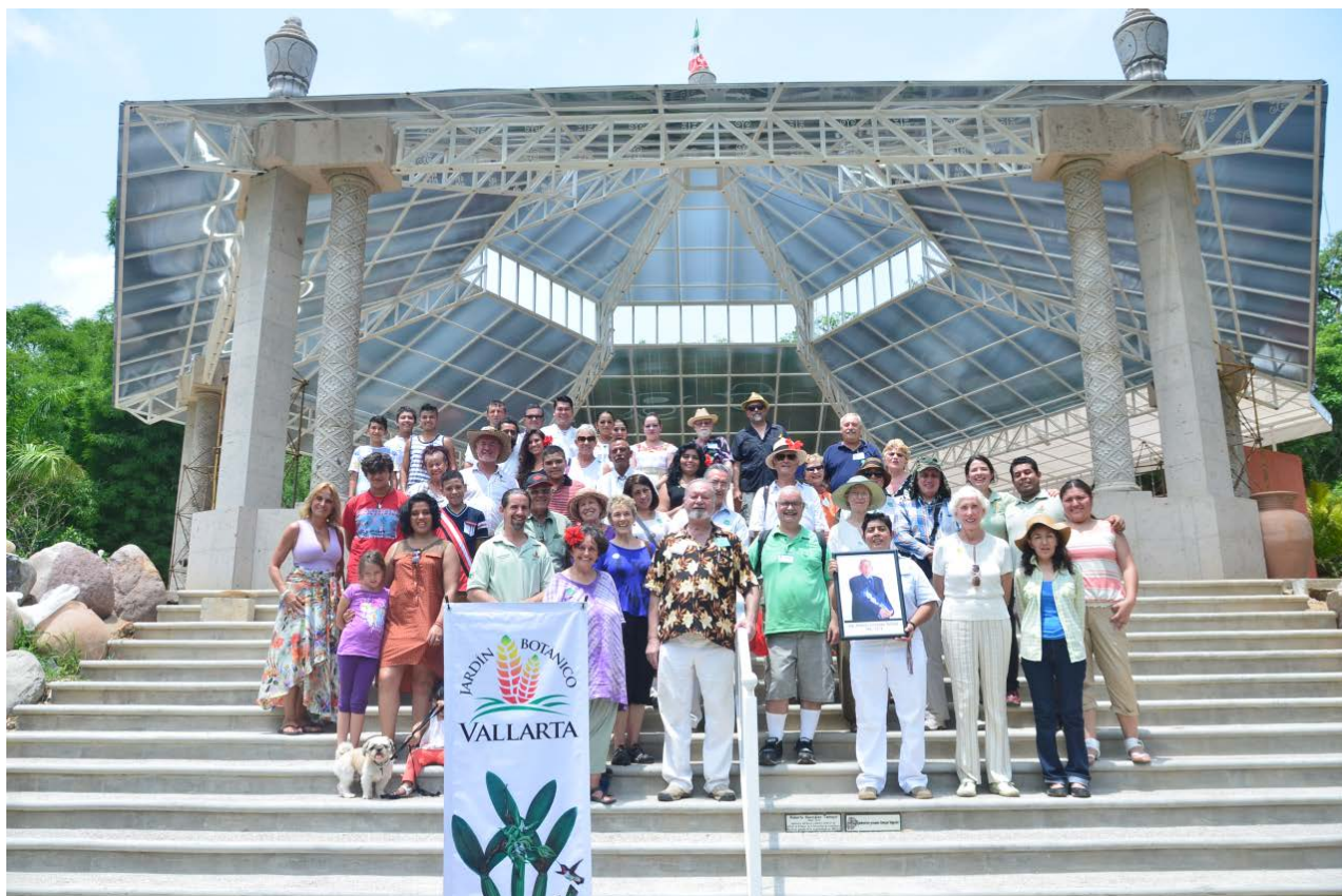
Dedication of the stairway to the Vallarta Conservatory of Mexican Orchids