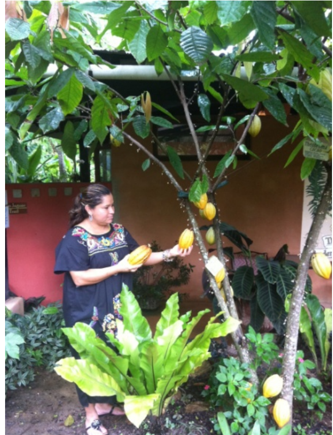
Cocoa Trees at the Vallarta Botanical Gardens