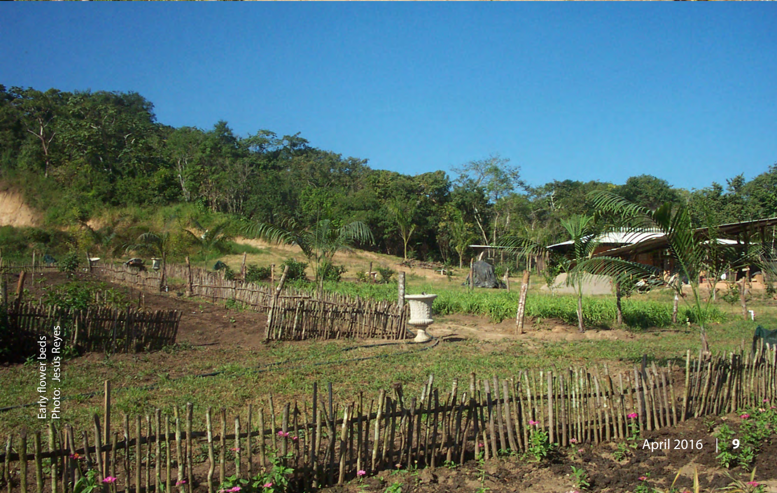
Early flower beds