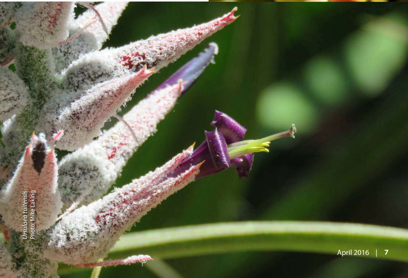
Ursulaea tuitensis