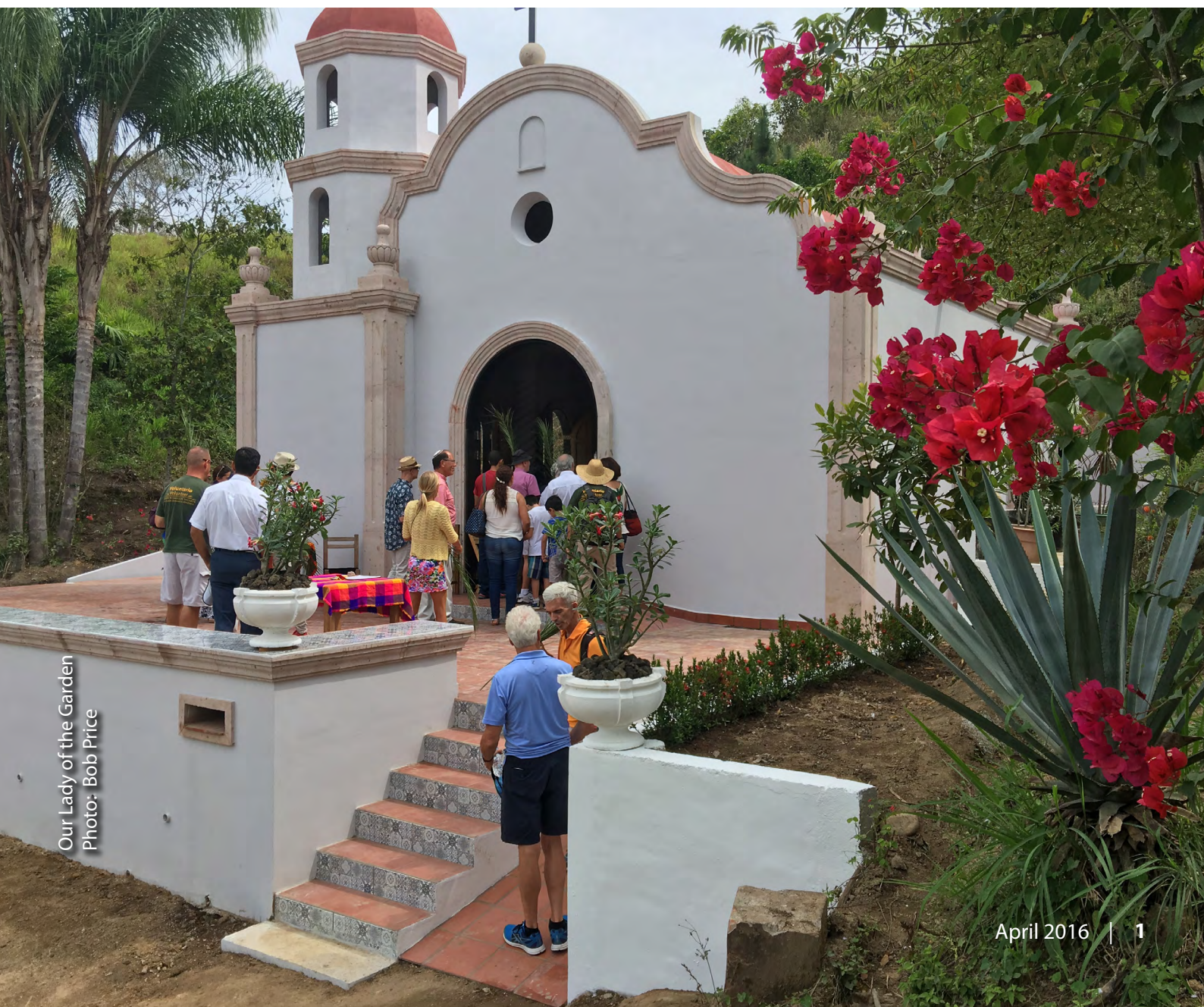
Our Lady of the Garden