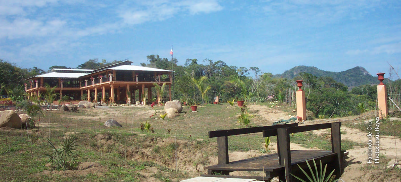
Hacienda de Oro