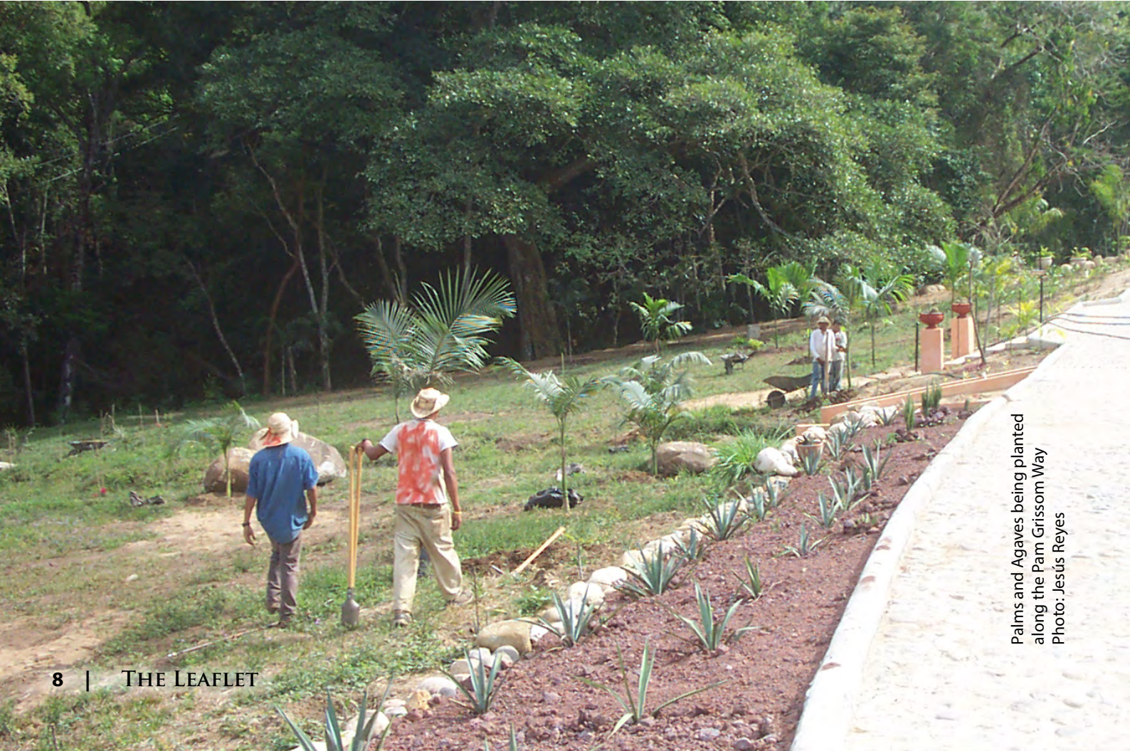
Palms and Agaves being planted along the Pam Grissom Way