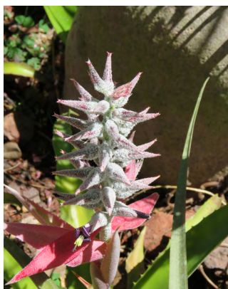
Cover: Mike Laking Ursulaea tuitensis