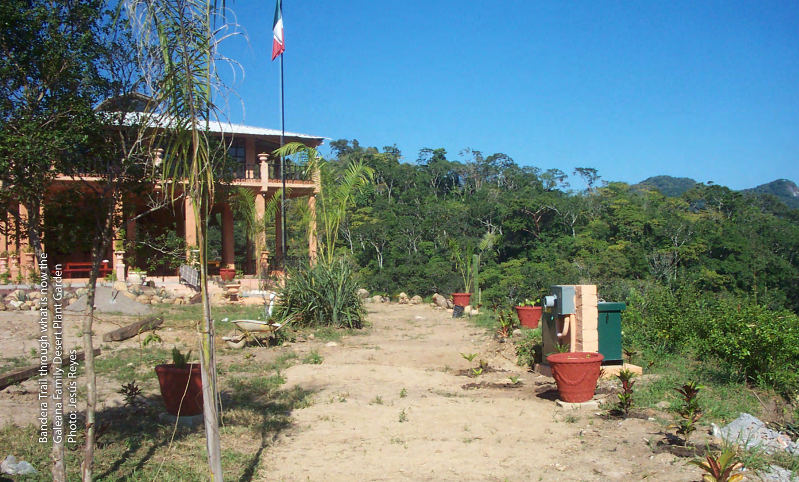
Bandera Trail through what is now the Galeana Family Desert Plant Garden