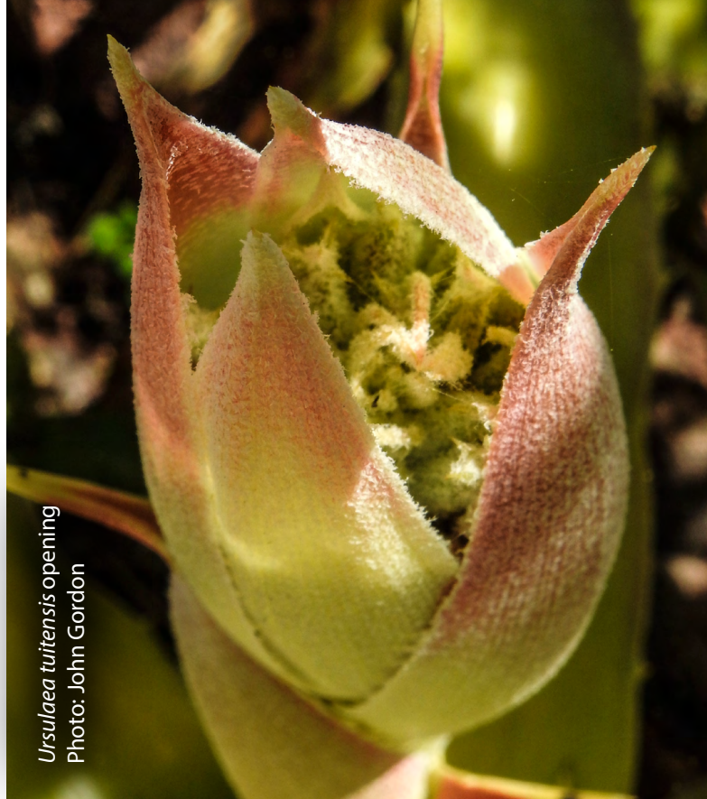
Ursulaea tuitensis opening

Both plants are very beautiful and could be valued additions to any garden. When the origins of their names are known, connecting them to people who were passionate about the flora of the world, plants become even more interesting.