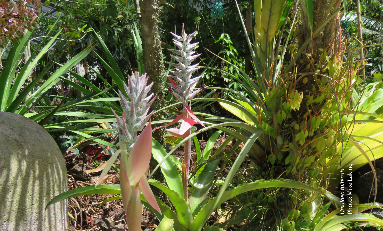
Ursulaea tuitensis