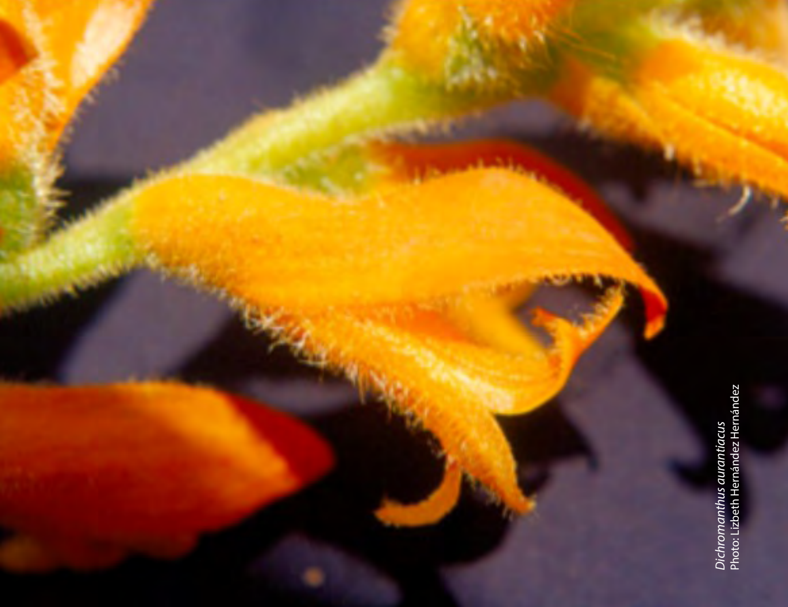
Dichromanthus aurantiacus