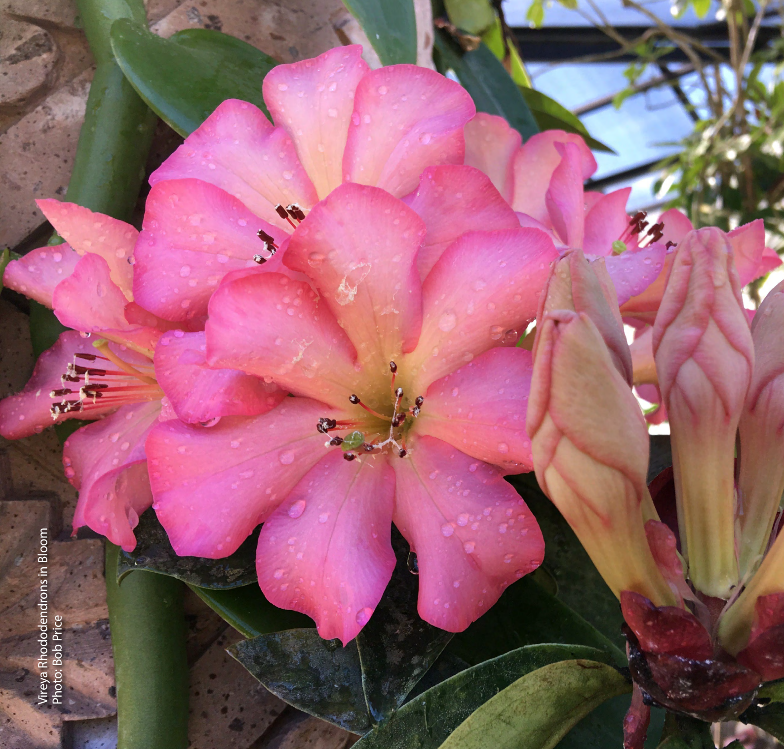
Vireya Rhododendrons in Bloom