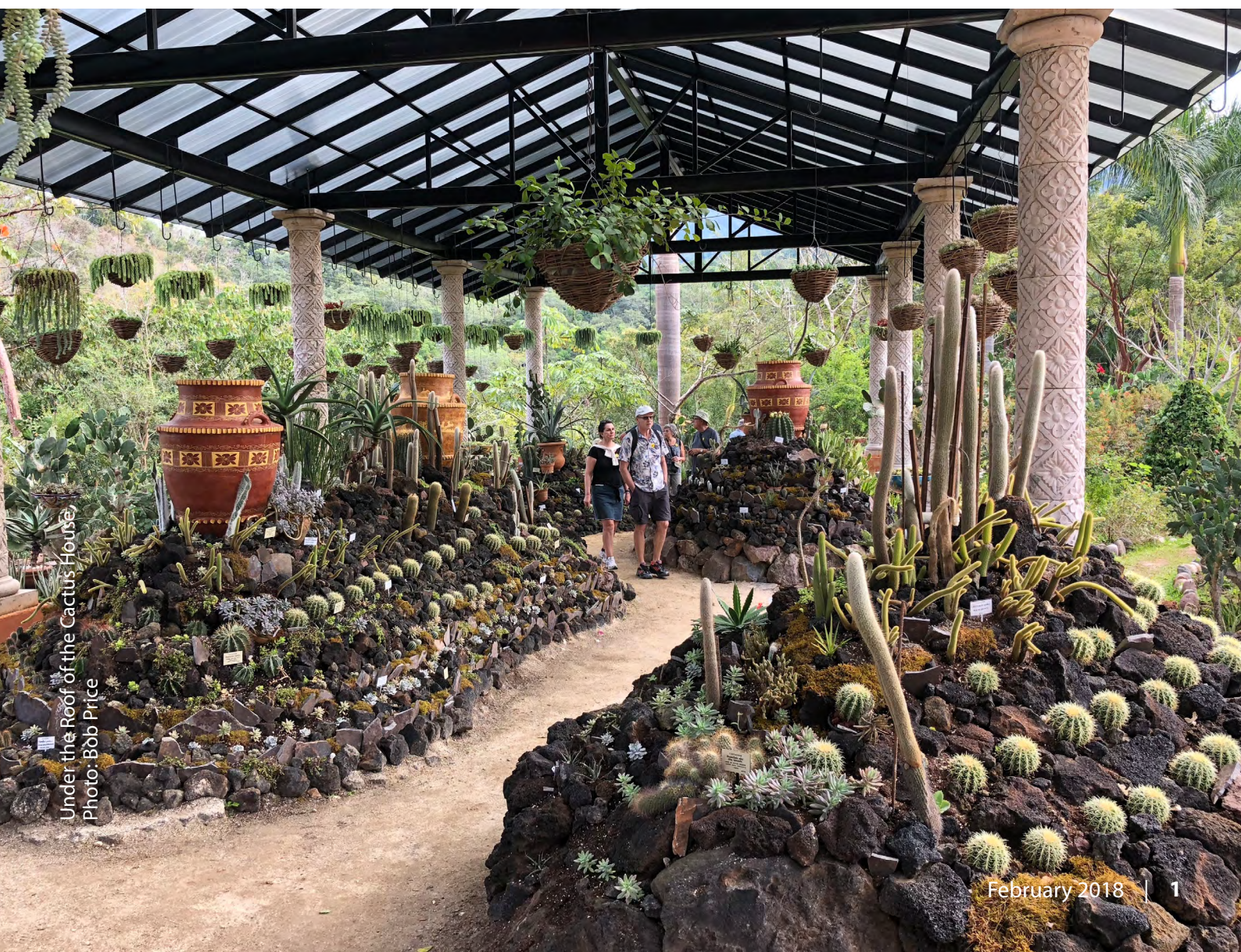
Under the Roof of the Cactus House