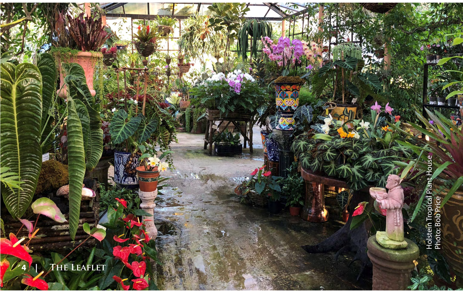
Holstein Tropical Plant House