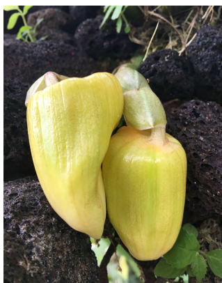
Cover: Stanhopea