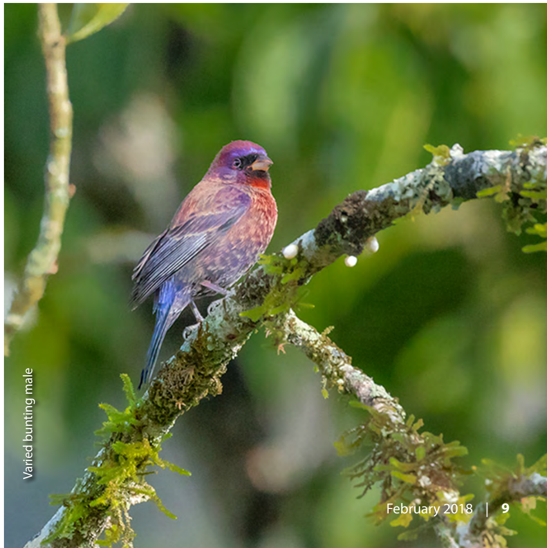
Varied bunting male

Facebook: Vallarta Birders Vallarta Botanical Gardens AC