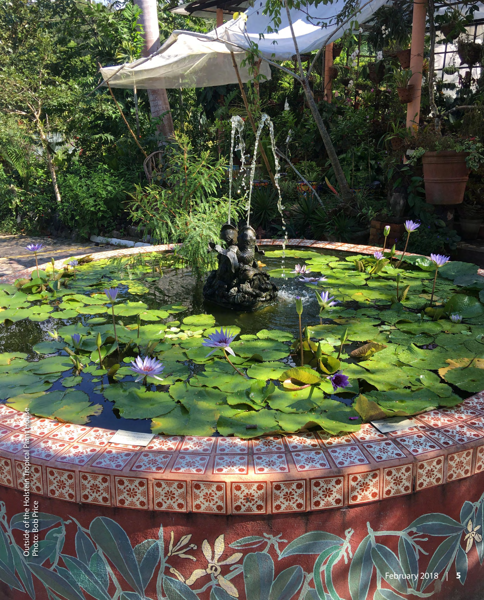
Outside of the Holstein Tropical Plant House