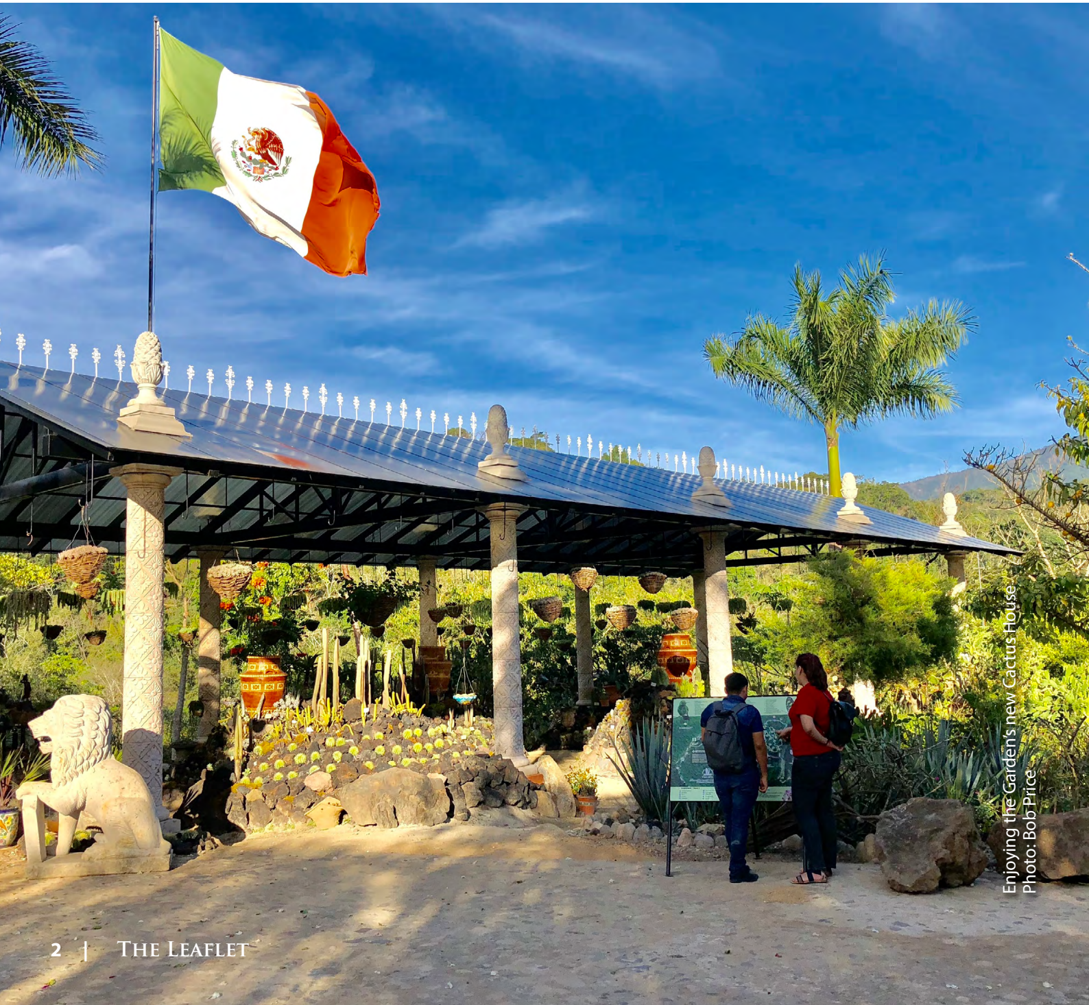
Enjoying the Garden's new Cactus House.

This event is free for all members and is also a perfect occasion to renew your membership or join as a member for the first time. We'll have a complimentary buffet available for Garden members (see details in forthcoming member email) and folkloric dancers and extra tours available for all to enjoy. This is a very busy day at the Garden so please carpool or take public transportation if you can. Festivities begin at 11 am. Be prepared to celebrate!