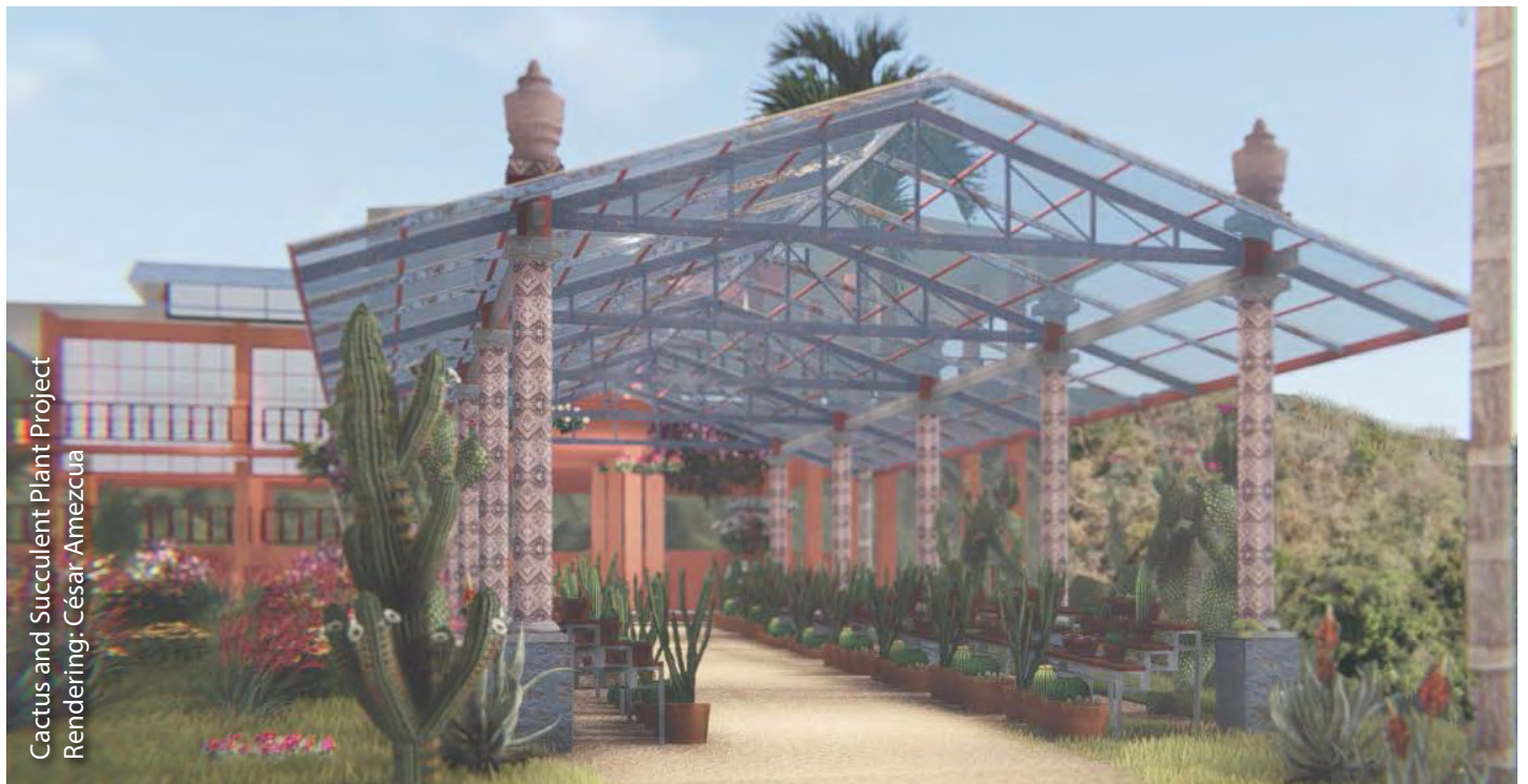
Cactus and Succulent Plant Project