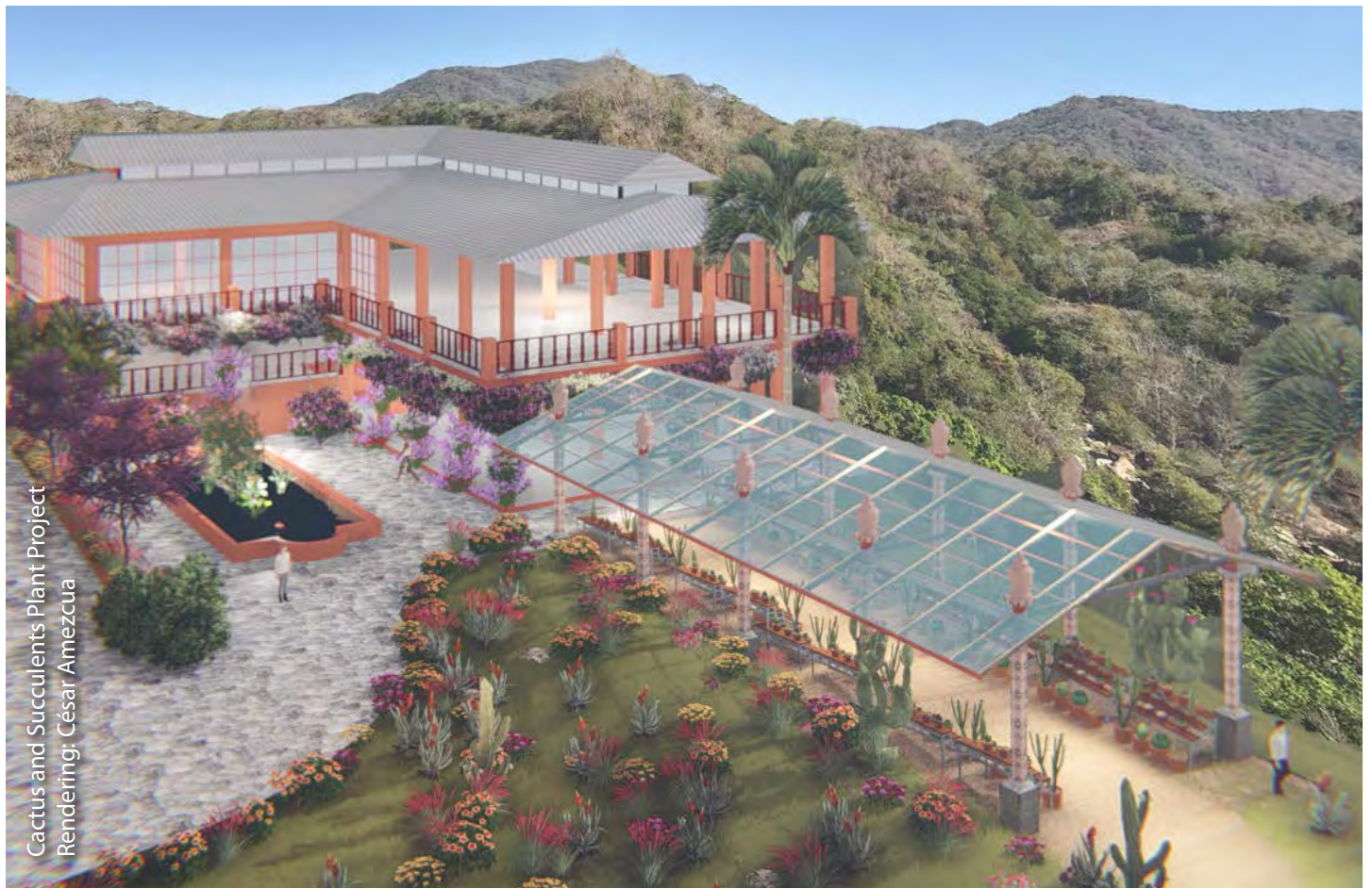
Cactus and Succulents Plant Project