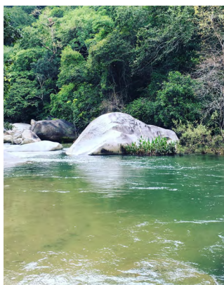
Cover: Río Horcones