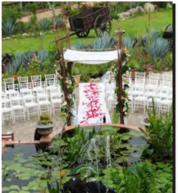
Why not have your special day in one of the most beautiful places in the world? There are many sites around the gardens where a wedding can be performed. From a simple wedding with just a few friends, to a lavish event with all the trimmings.

Consult the Vallarta Botanical Gardens wedding planner for more ideas. +52 (322) 223 6182 or (322) 223 6184 eventos@vbgardens.org