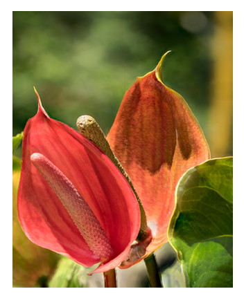
Cover: Anthurium sp.