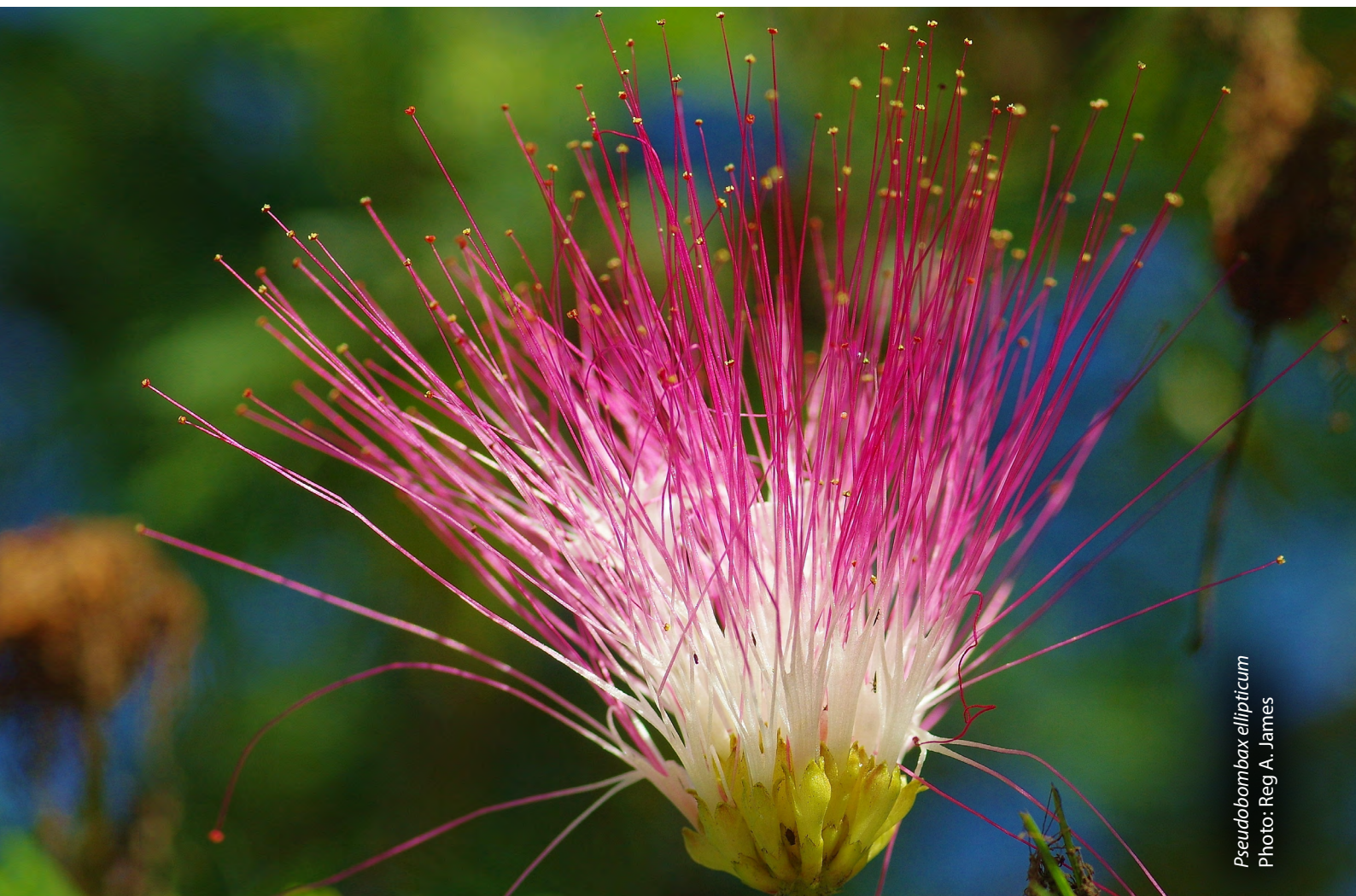
Pseudobombax ellipticum

Local and visiting artists are encouraged to submit pieces for consideration in this exhibition which will be selected by a committee of representatives from the Garden, the Mall, and the University. Pieces may include paintings, photos, and sculptures. For more information on the exhibition or how to send submissions, please write to eventos@vbgardens.org .