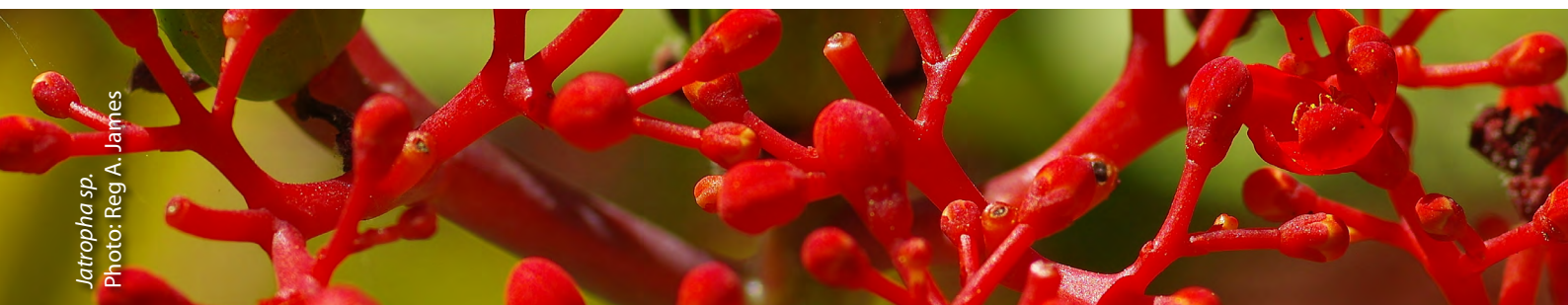
Jatropha sp.