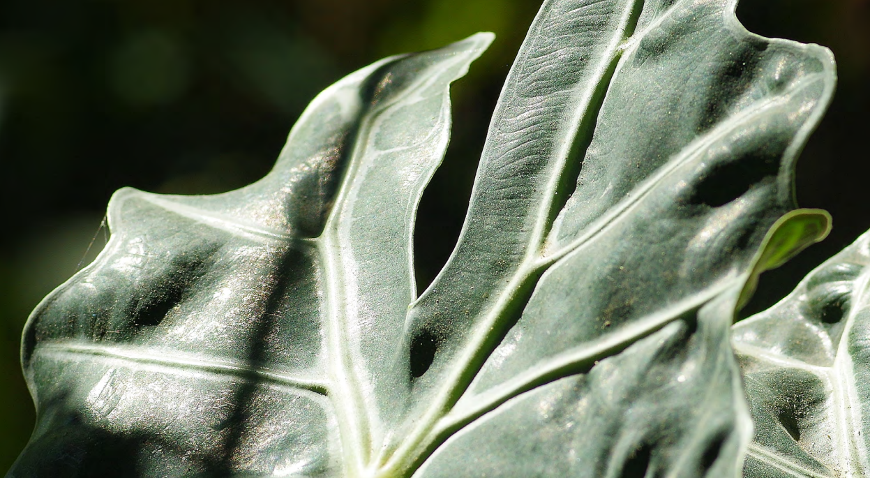
Alocasia sp.