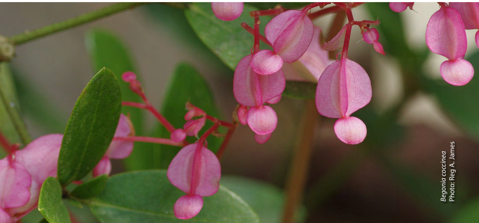
Begonia coccinea

* Some activities subject to change. The most current calendar, often with links to further event information, can be viewed at www.vbgardens.org/calendar .