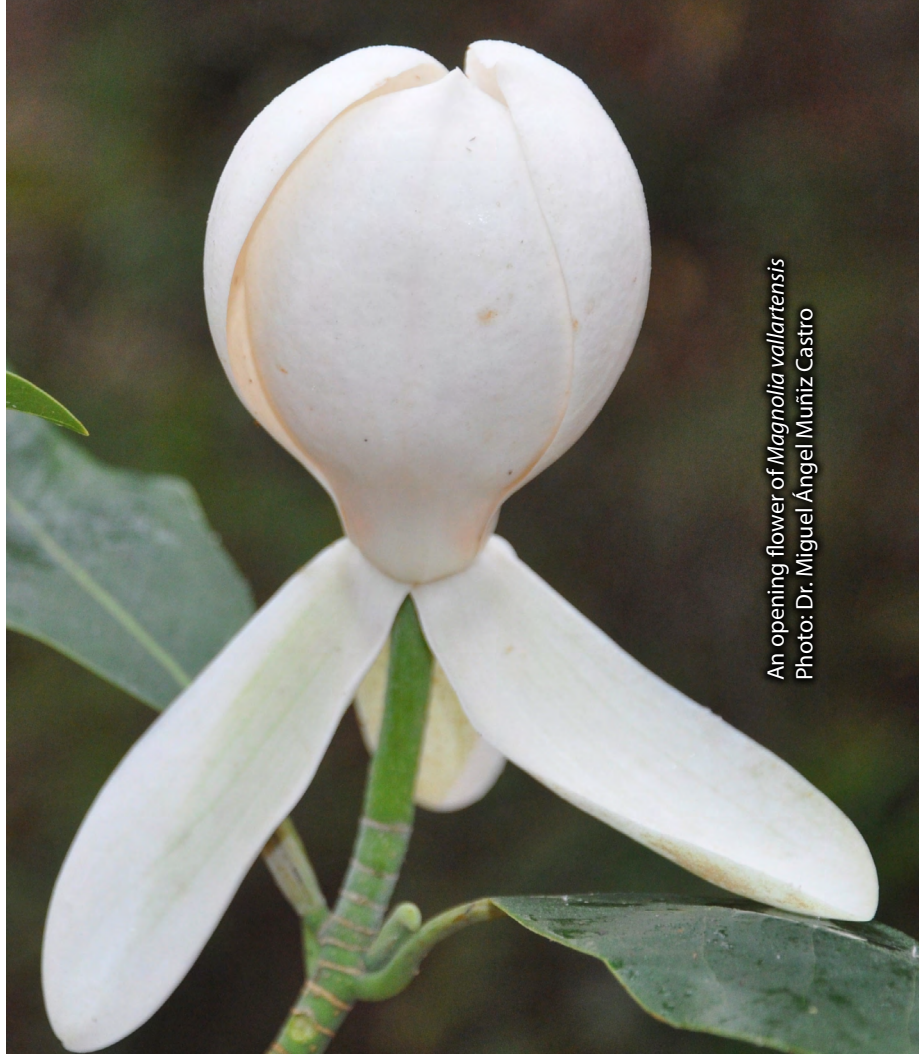
An opening flower of Magnolia vallartensis