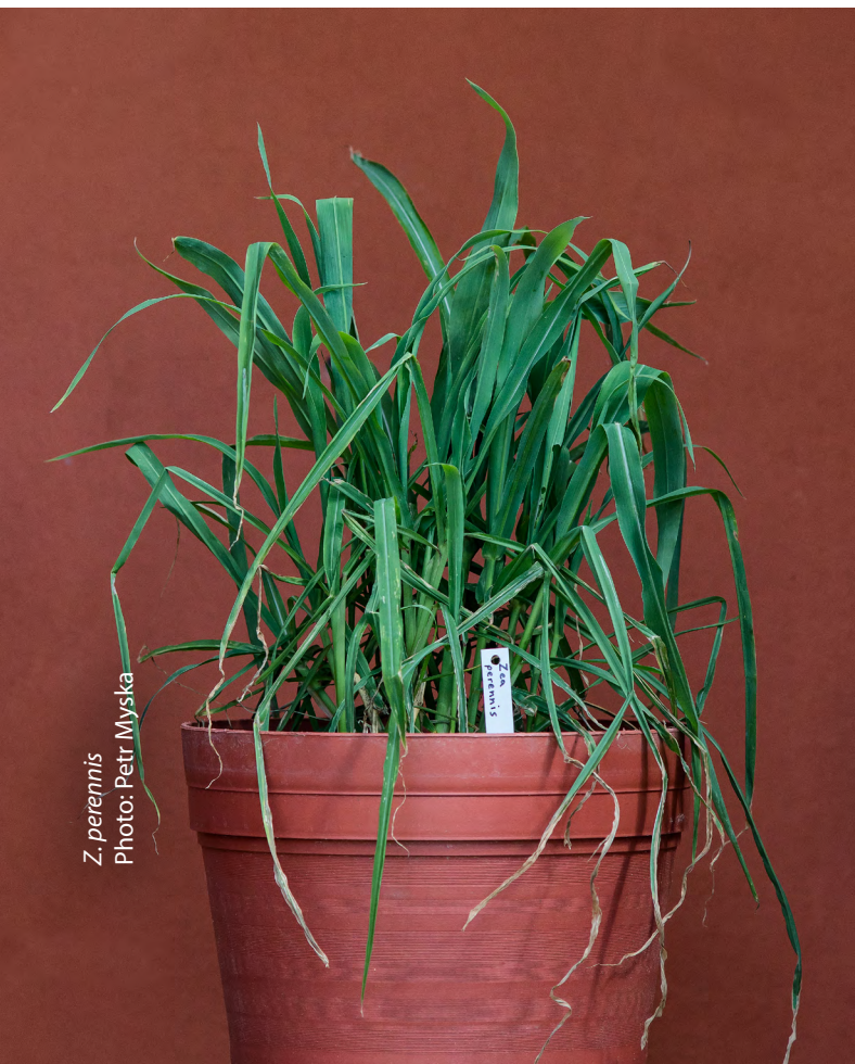
Z. perennis