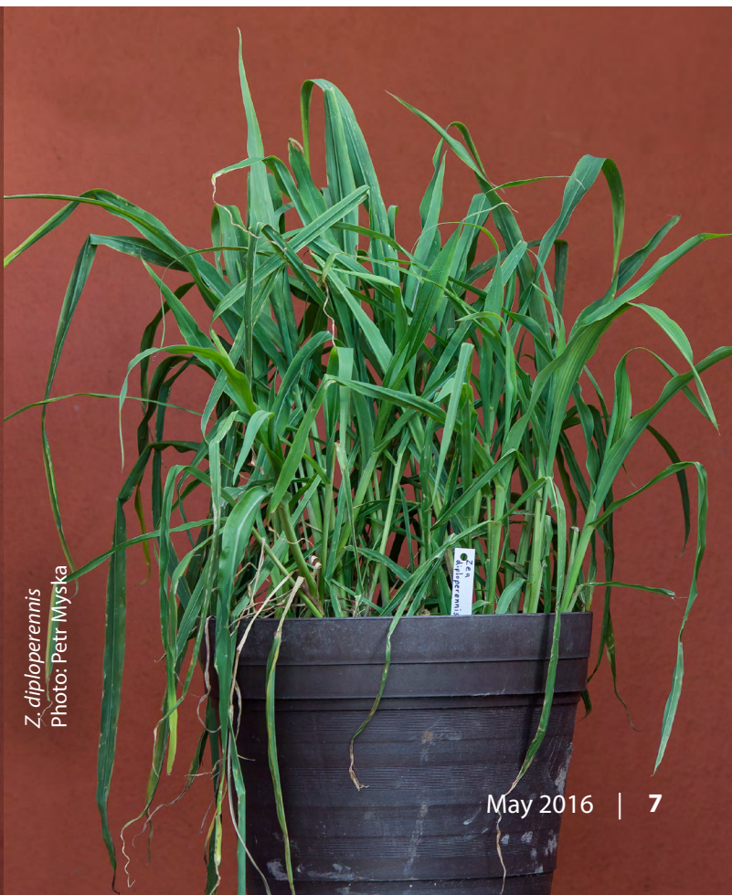
Z. diploperennis