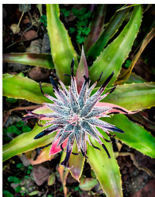
Cover: Petr Myska Ursulaea tuitensis