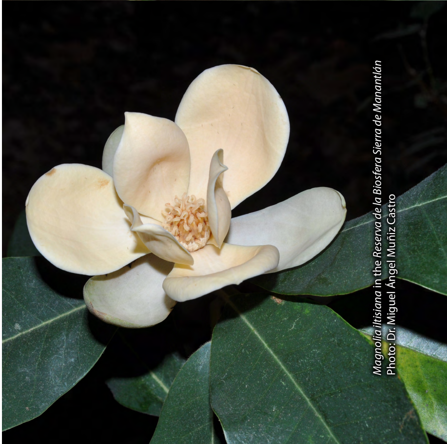
Magnolia ititana in the Reserva de la Biosfera Sierra de Manantlán