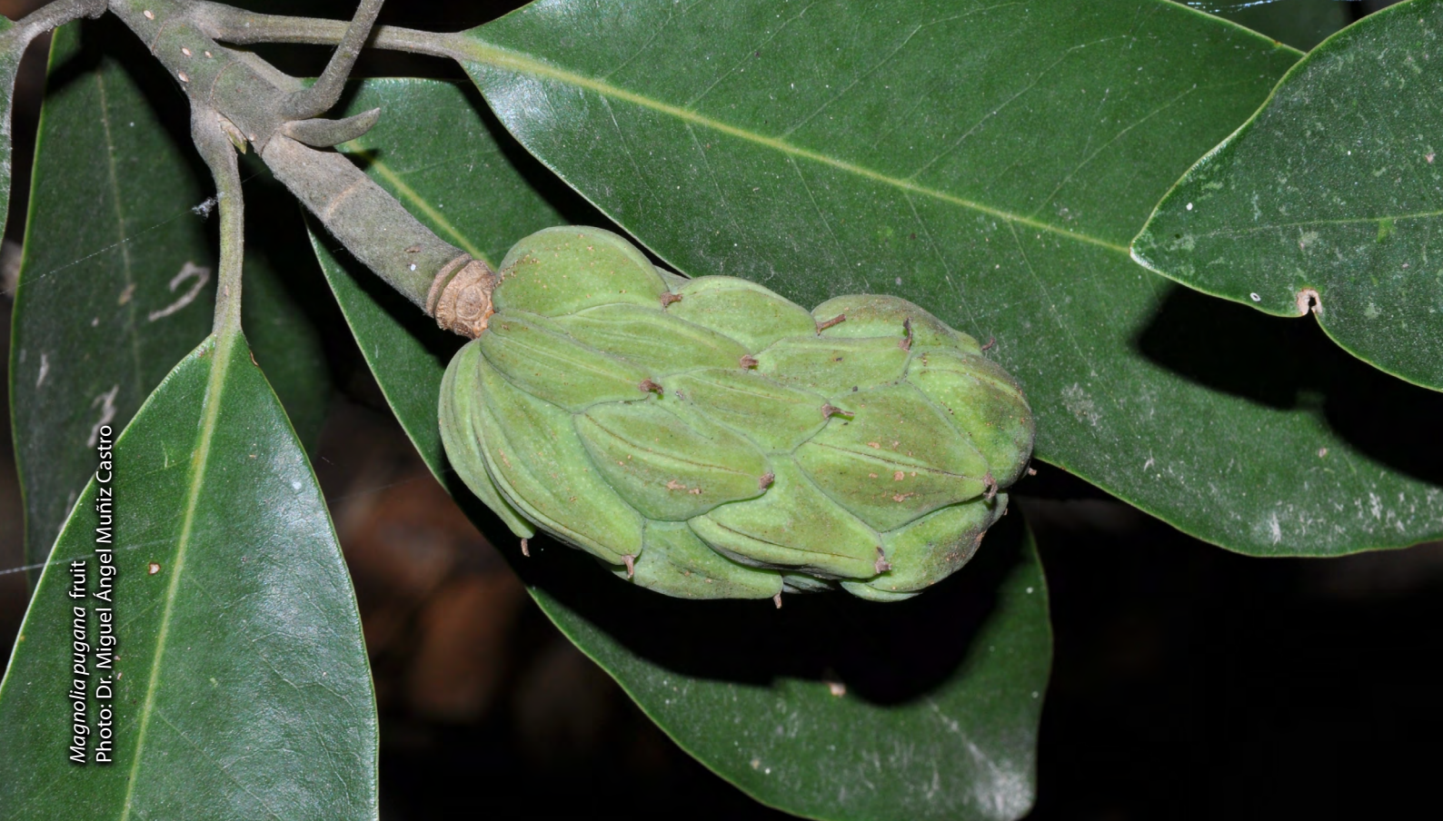
Magnolia pugana fruit