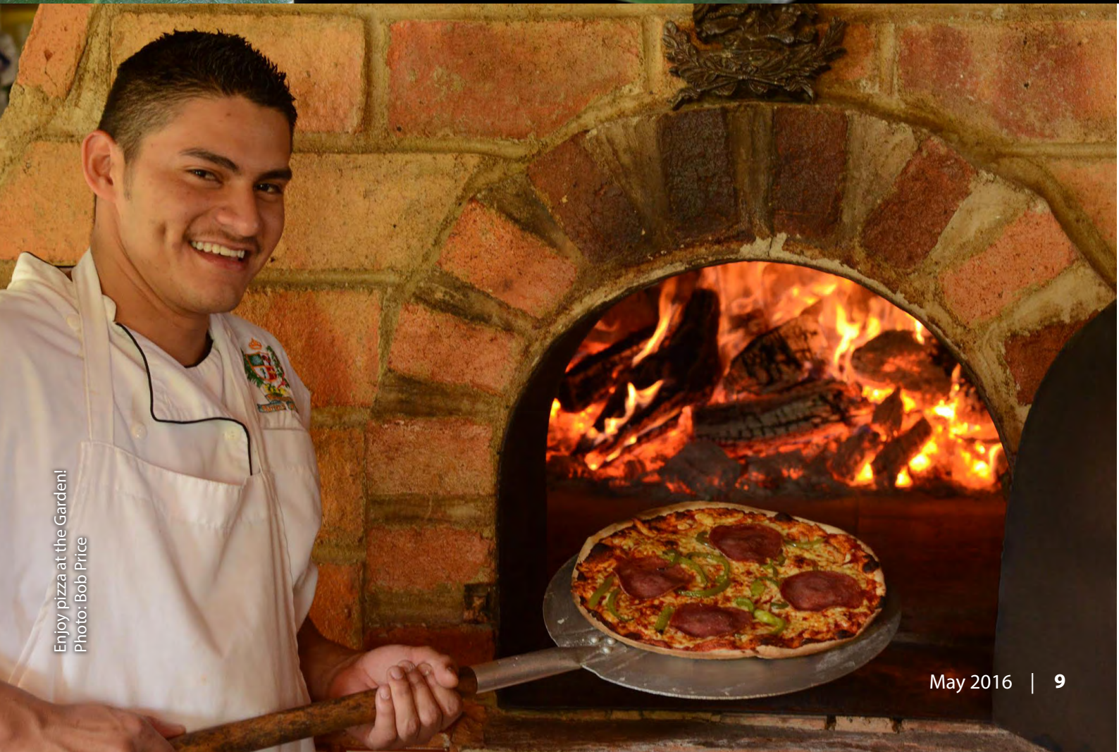
Enjoy pizza at the Garden!