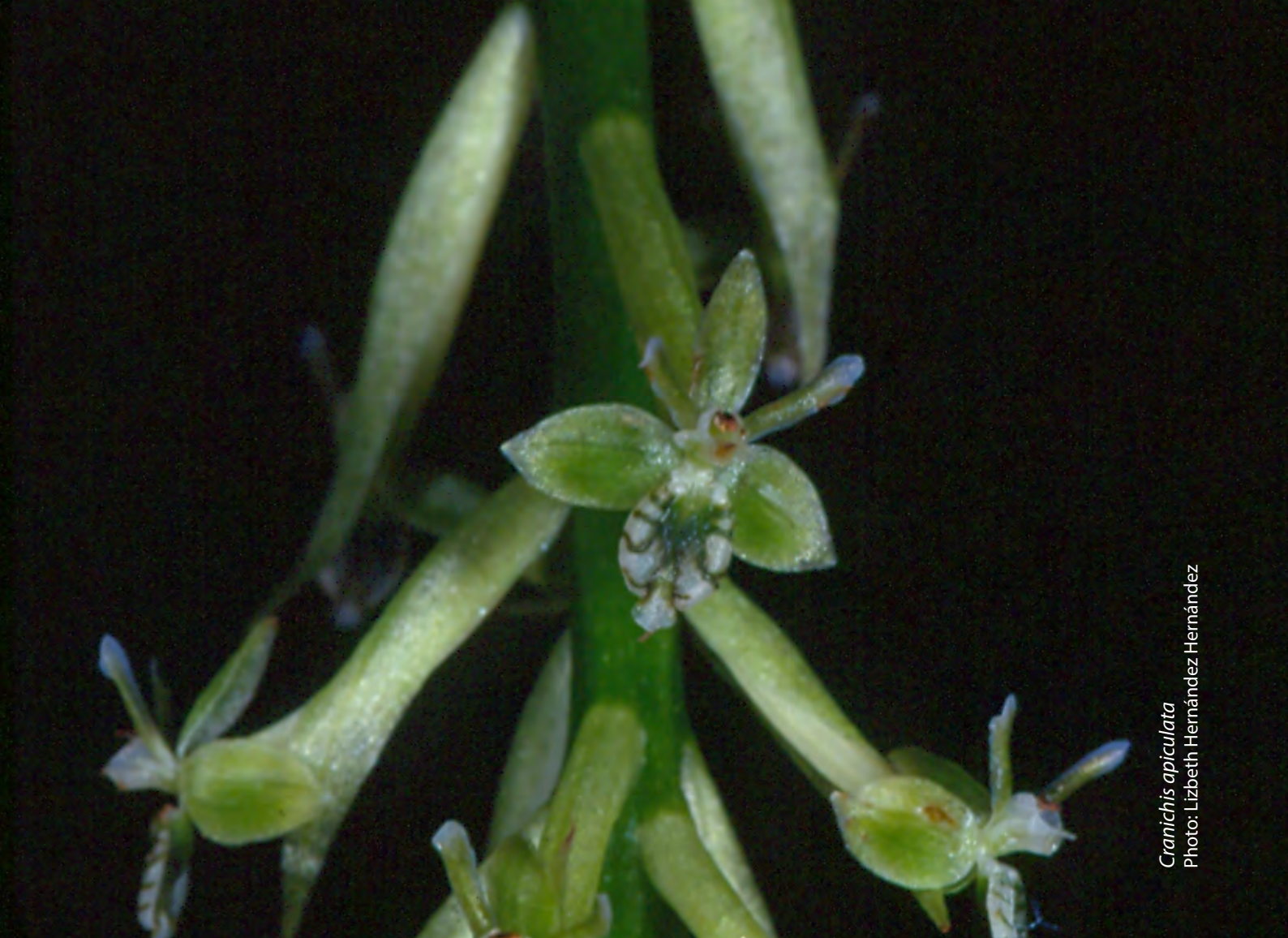
Cranichis apiculata