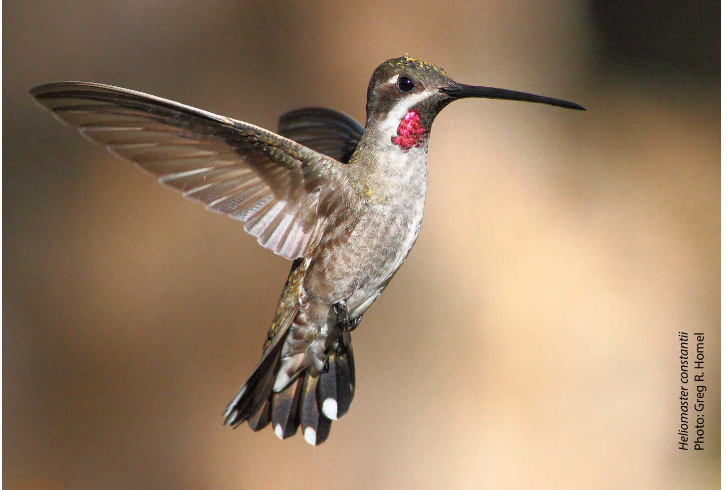
Heliomaster constantii