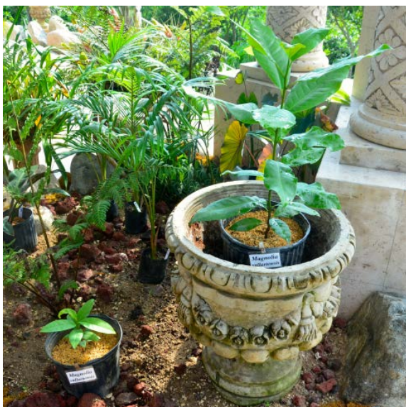
Magnolia vallartensis now on display at the VBG

With the description of dozens of new species of Neotropical magnolias in the past two decades, Mexico is now considered the top country in the Americas for Magnolia species diversity*. Jalisco state alone boasts six different species including that of Magnolia vallartensis , discovered in gallery forests along mountainous zones within the city limits of Puerto Vallarta, and described in 2012.