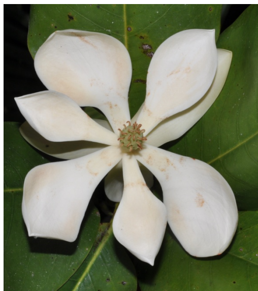
Mature M. vallartensis blooming in the wild