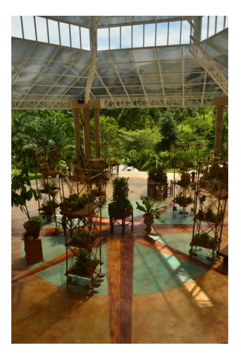
Interior of the Vallarta Conservatory of Mexican Orchids upon completion of construction in July and with plants in October.