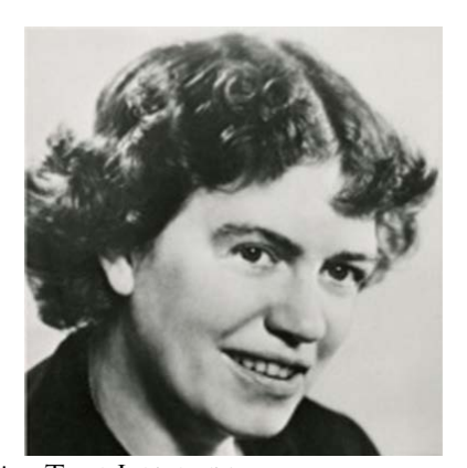
"Never doubt that a small group of thoughtful, Committed citizens can change the world; indeed, it's the only thing that ever has."

Contributions are still needed and matching funds up to $50,000 USD have been extended until the end of 2014! Please contribute to a legacy to our beloved Vallarta community by supporting this conservatory project.