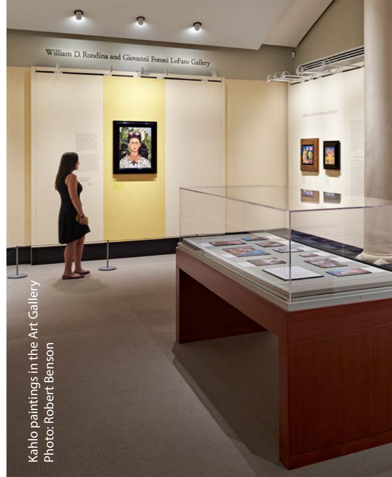
Kahlo paintings in the Art Gallery

For a fleeting moment, visitors to the NYBG can travel through Kahlo's world made all the brighter by a fresh botanical perspective into the beautiful mind of this widely influential artist and the ripe and fruitful lessons of her timeless garden.