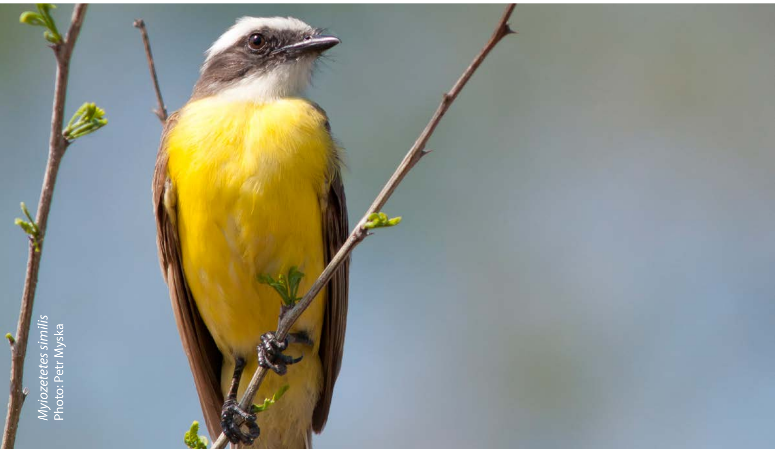
Myiozetetes similis

These birds are far from shy, and their loud and frequent vocalizations give them away quite easily. In fact, any doubt to this bird’s identification can be put to rest by learning its calls and that of its similarly appearing distant relatives.