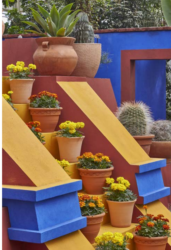
Pyramid Detail in the Haupt Conservatory

Instead of the common focus on Kahlo's troubled life often examined through her sufferings, the NYBG team has shifted attention to her nature-based inspirations from the wilds of tropical Mexico and her living collections within her home garden at her lifelong residence, Casa Azul. Curious cactus, bursting blooms of marigolds,