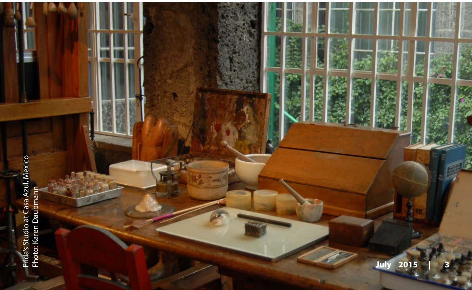
Frida's Studio at Casa Azul, Mexico